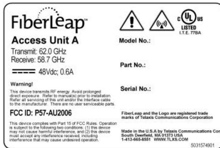
PHOTOGRAPH 1: EUT LABEL ACCESS UNIT A

In accordance with part 2 section .925 and .926 of the commissions rules. The label is shown below. Since there are two units which vary in frequency, referred to as an A type and a B type unit, there are two labels to differentiate.