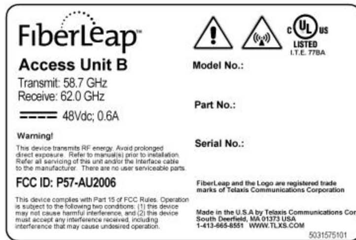
PHOTOGRAPH 2: EUT LABEL ACCESS UNIT B