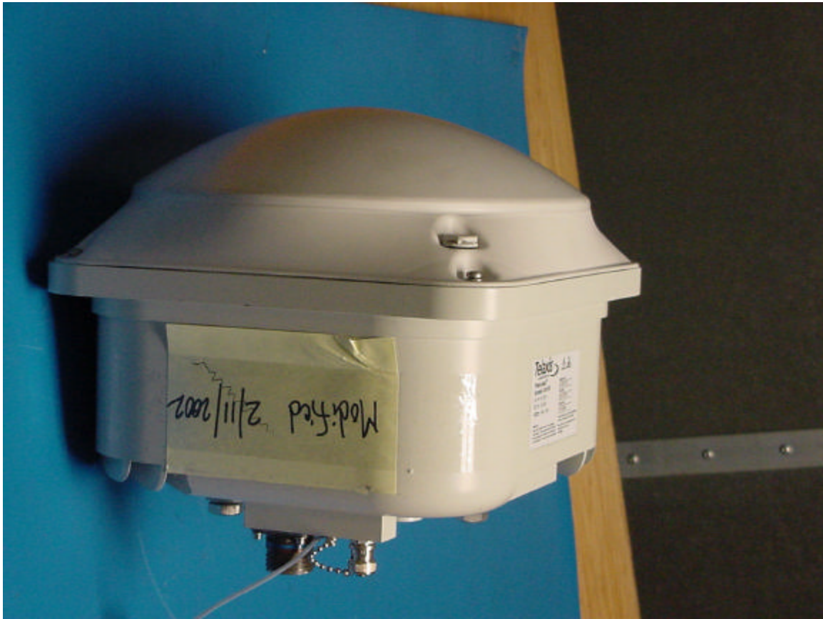
PHOTOGRAPH 7: EUT RIGHTSIDE VIEW