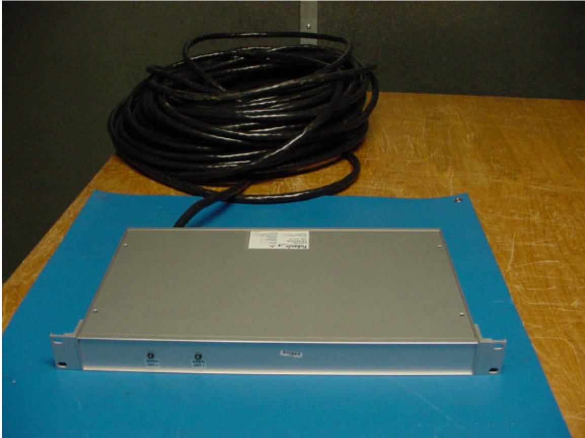
PHOTOGRAPH 10: FIBER BREAKOUT BOX FRONT VIEW