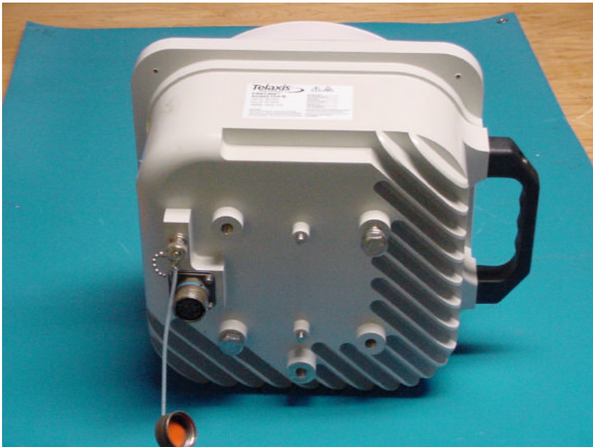
PHOTOGRAPH 8: EUT REAR VIEW