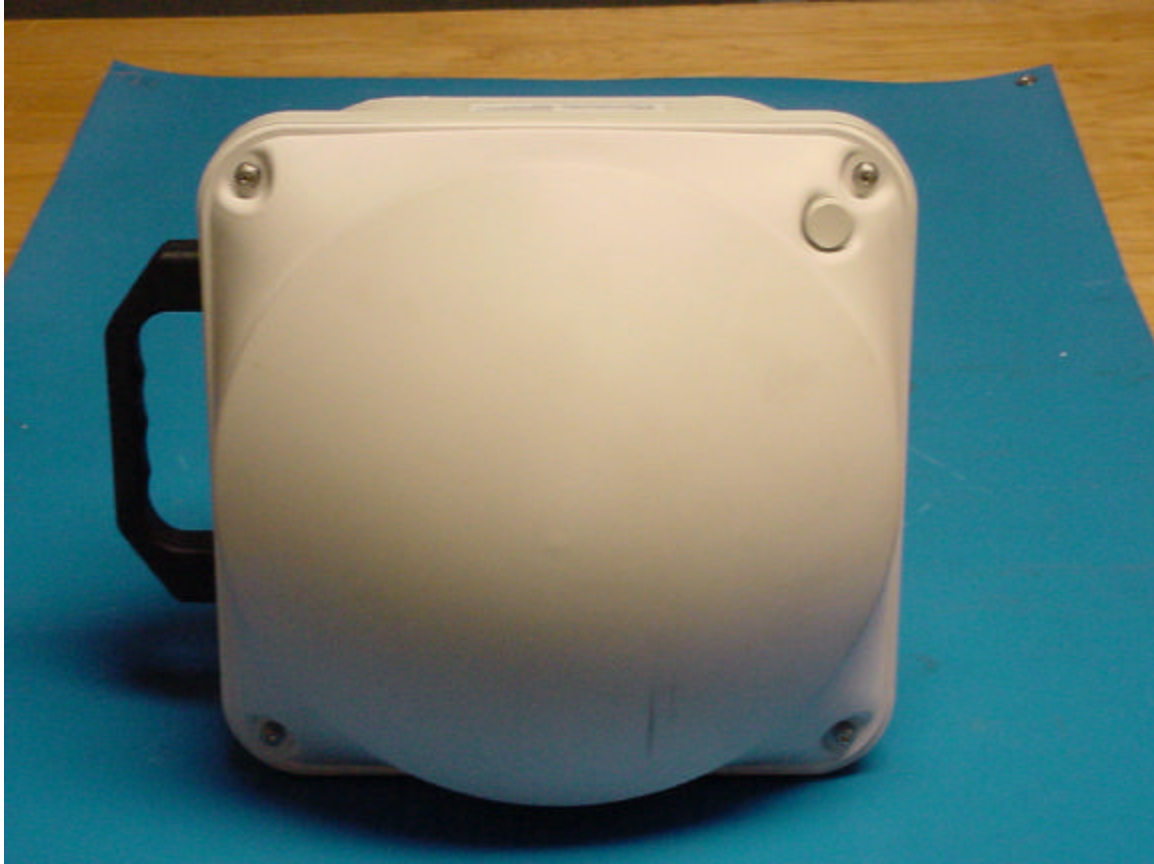
PHOTOGRAPH 6: EUT FRONT VIEW

Both access units are identical in mechanical construction. The external photographs in this appendix represent both access units.