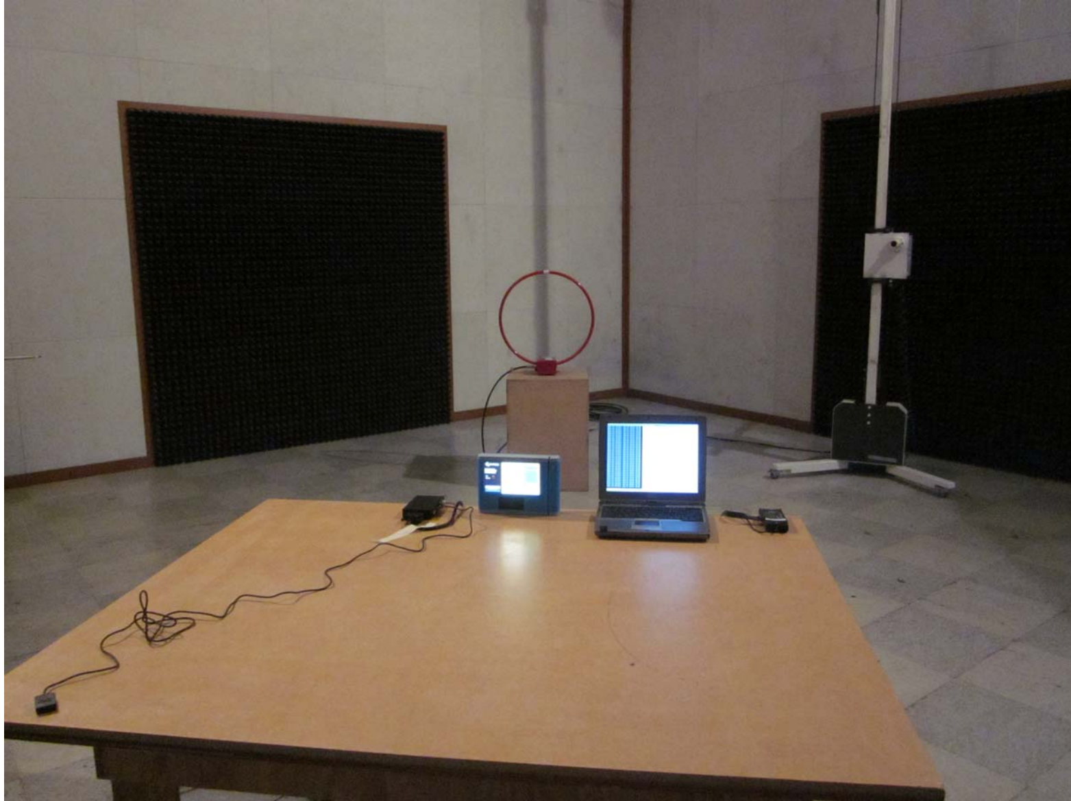
Below 30 MHz