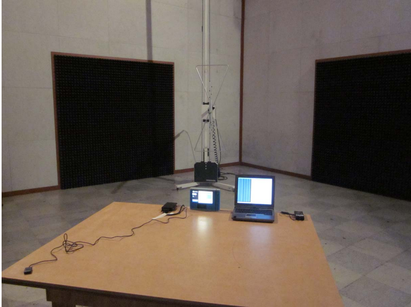
30 to 1000 MHz