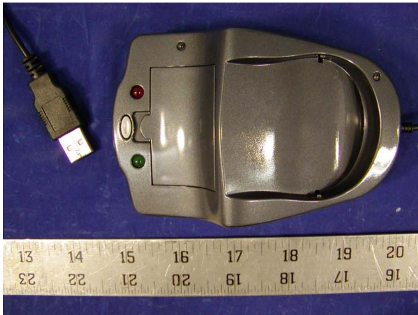
Receiver Chassis - Bottom View