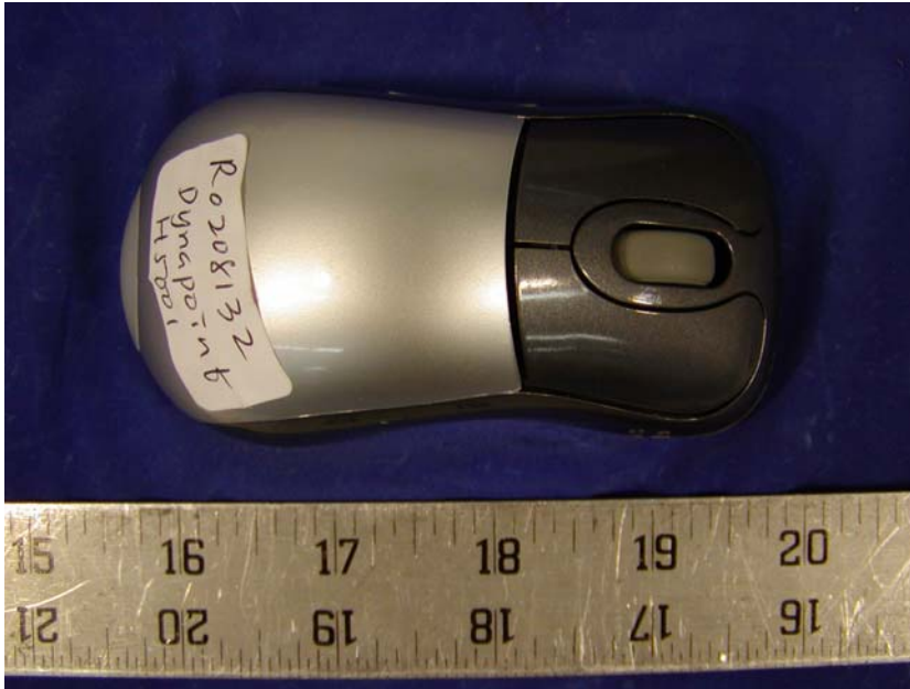
Transmitter Chassis - Bottom View