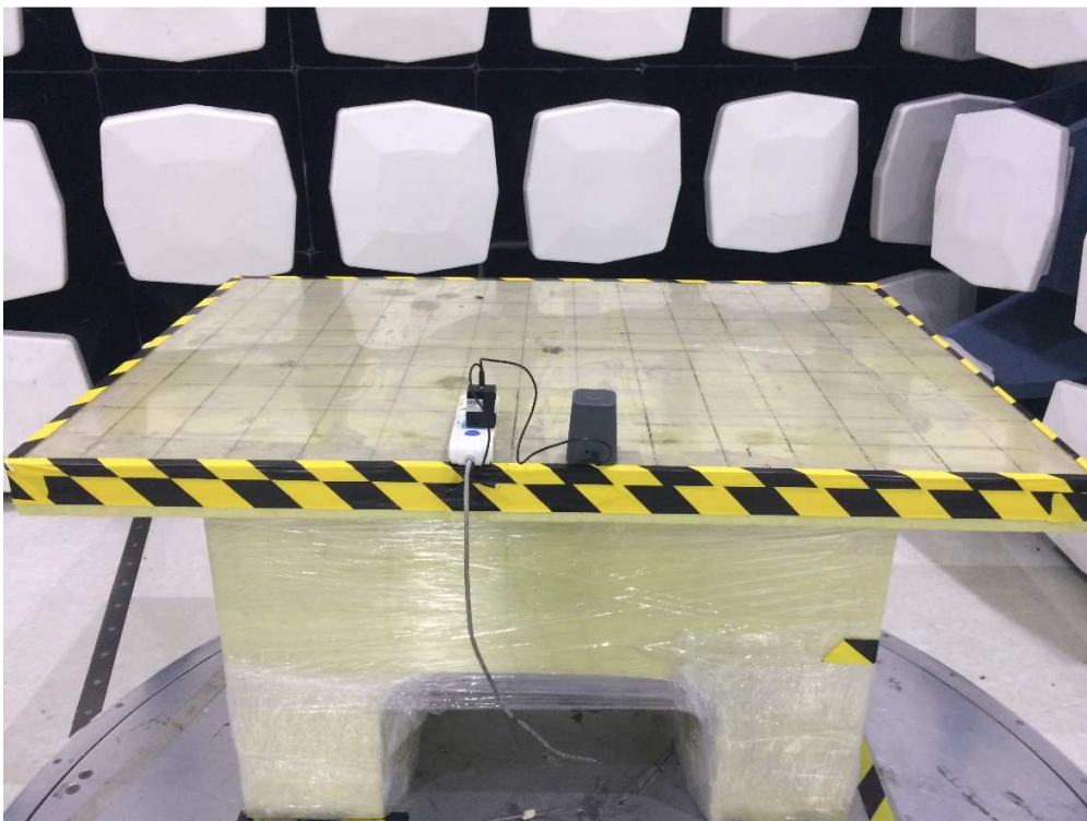
Up to 1GHz