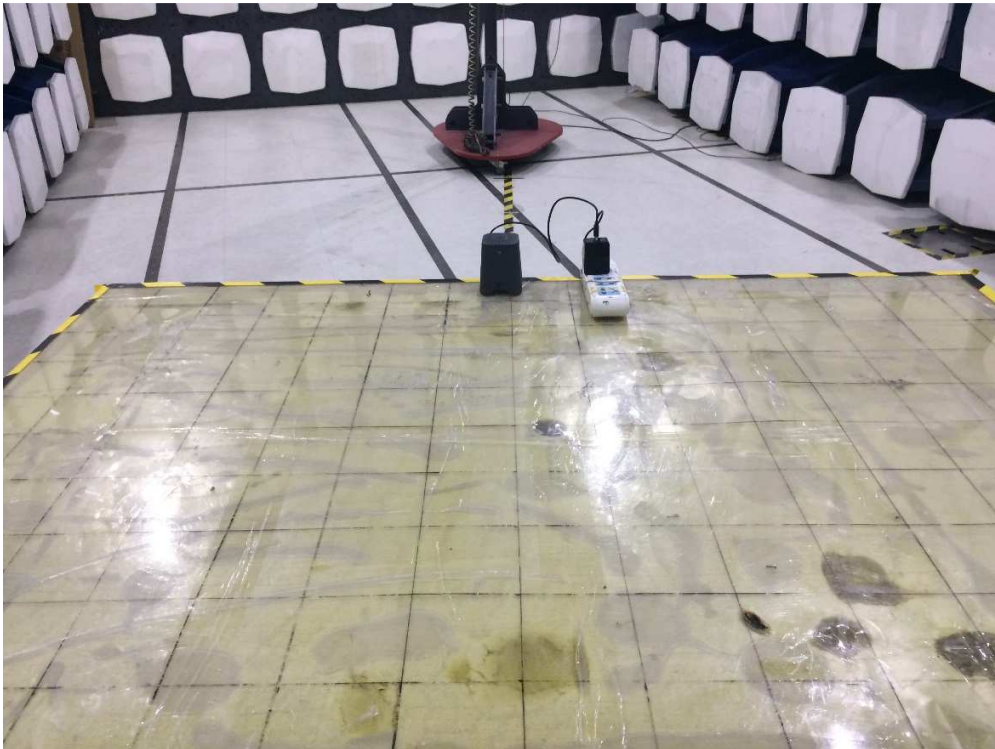
Radiated Emission Photos