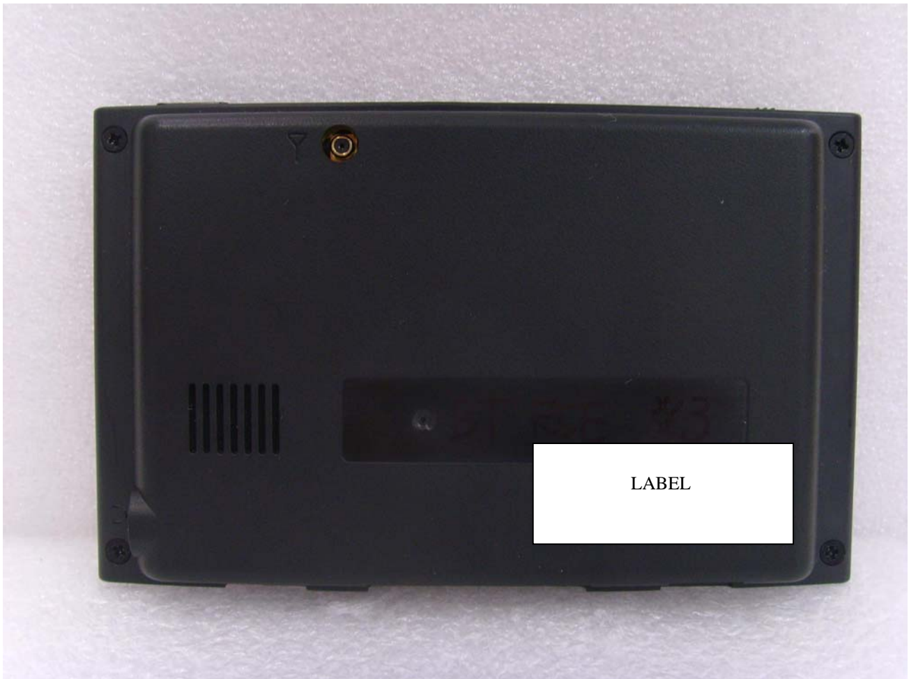
Figure 1.2 LABEL LOCATION

The label shown shall be permanently affixed at a conspicuous location on the device and be readily visible to the user at the time purchase. (Labeling requirements per 2.925)