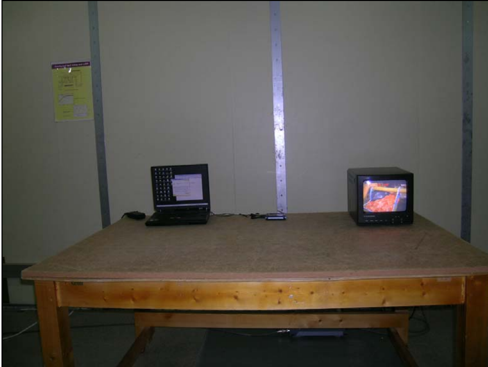
Photograph 1: Setup for Conducted Emissions