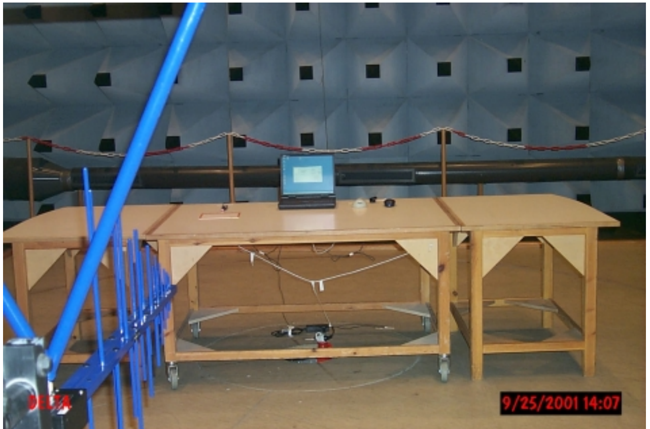
PHOTO A3.3 Radiated electromagnetic field emission (3 meter antenna distance)