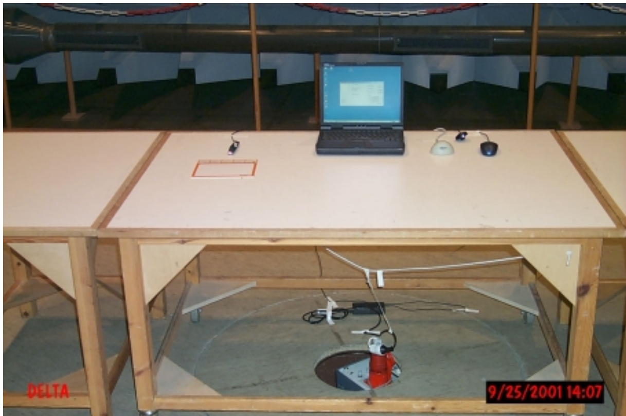
PHOTO A3.1 Radiated electromagnetic field emission