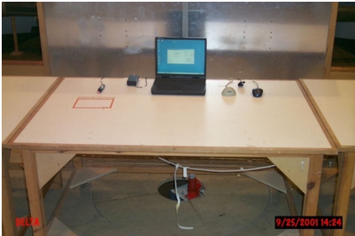
PHOTO A2.1 AC mains conducted emission measuring