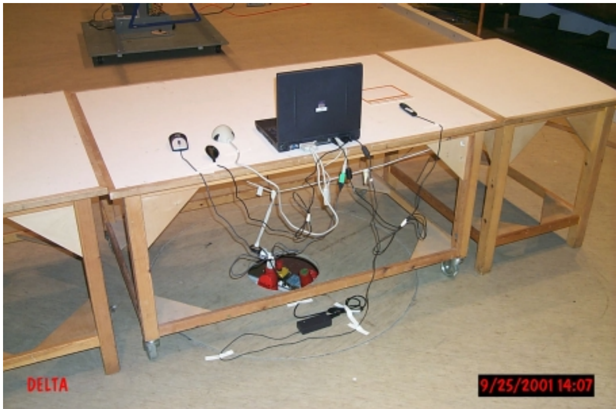
PHOTO A3.2 Radiated electromagnetic field emission