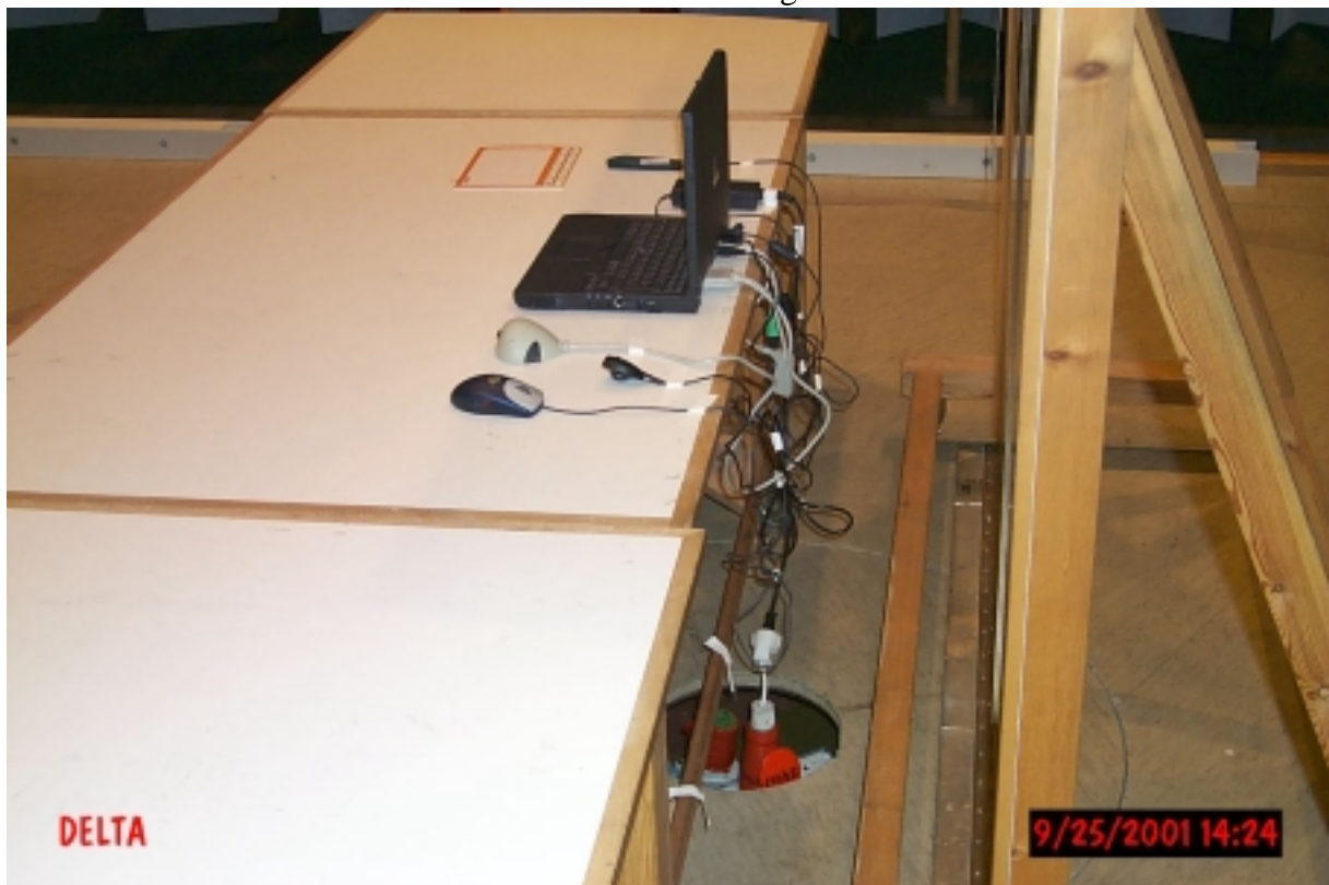
PHOTO A2.2 AC mains conducted emission measuring