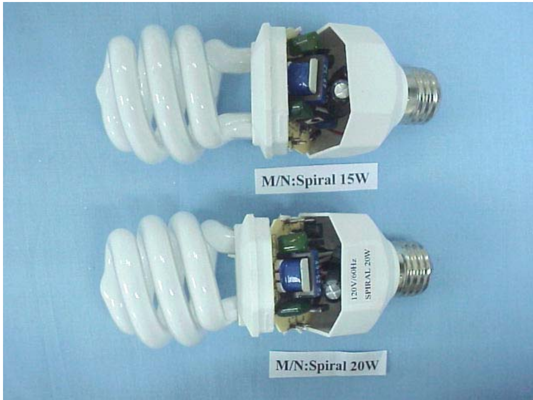
FIGURE 1 LIGHT(M/N: SPIRAL-15W, SPIRAL-20W) COVER REMOVED