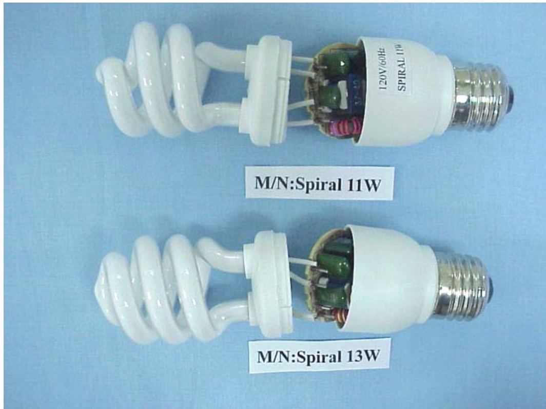
FIGURE 1 LIGHT (M/N: SPIRAL-11W, SPIRAL-13W) COVER REMOVED