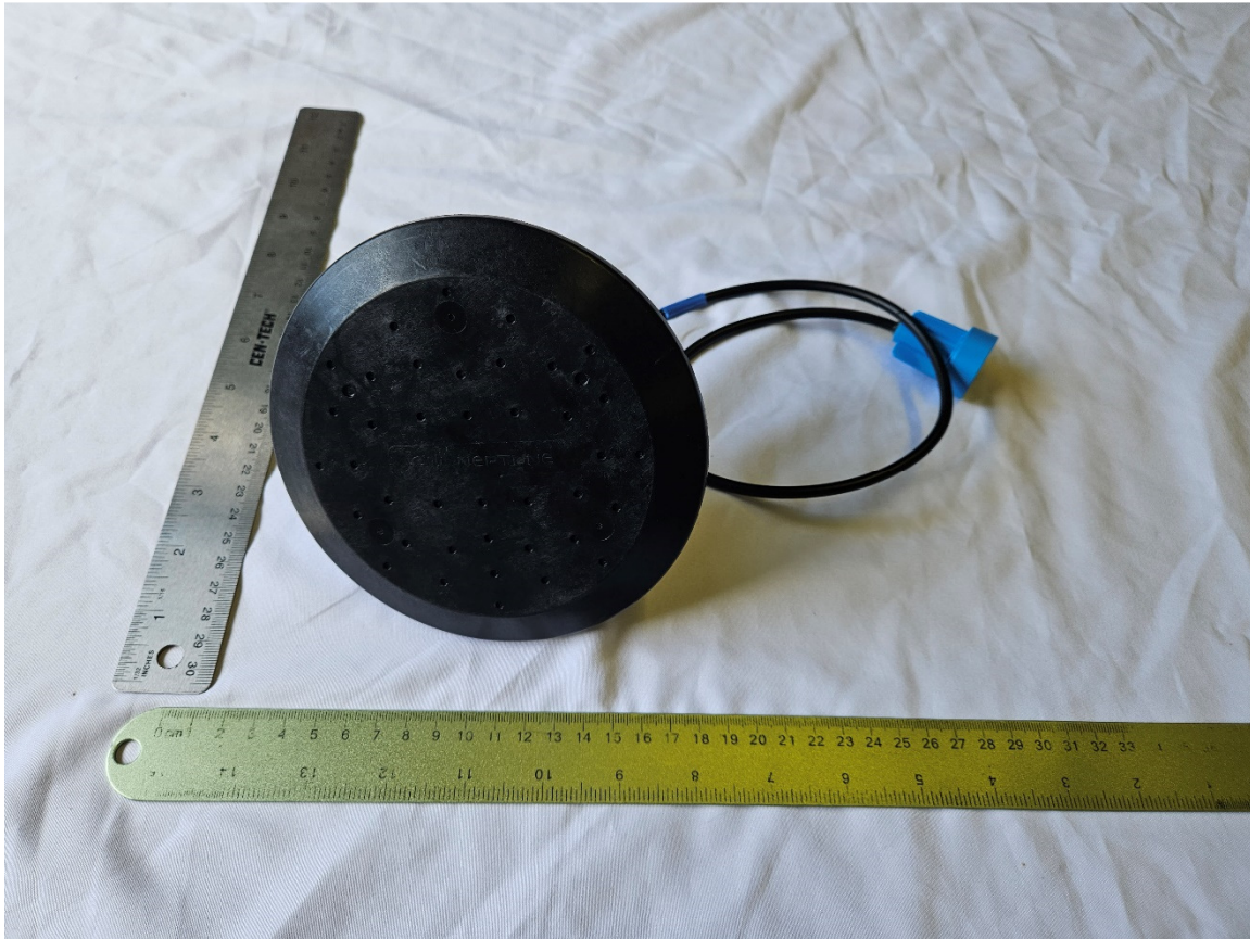
Figure 2. Pit Antenna Standalone

FCC Part 15 Class II Permissive Change P2SR900CE 4171B-R900CE 23-0195 October 17, 2023 Neptune Technology Group, Inc. R900