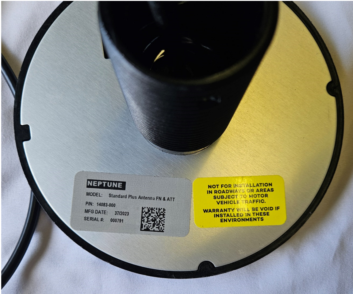
Figure 4. Pit Antenna Label

FCC Part 15 Class II Permissive Change P2SR900CE 4171B-R900CE 23-0195 October 17, 2023 Neptune Technology Group, Inc. R900