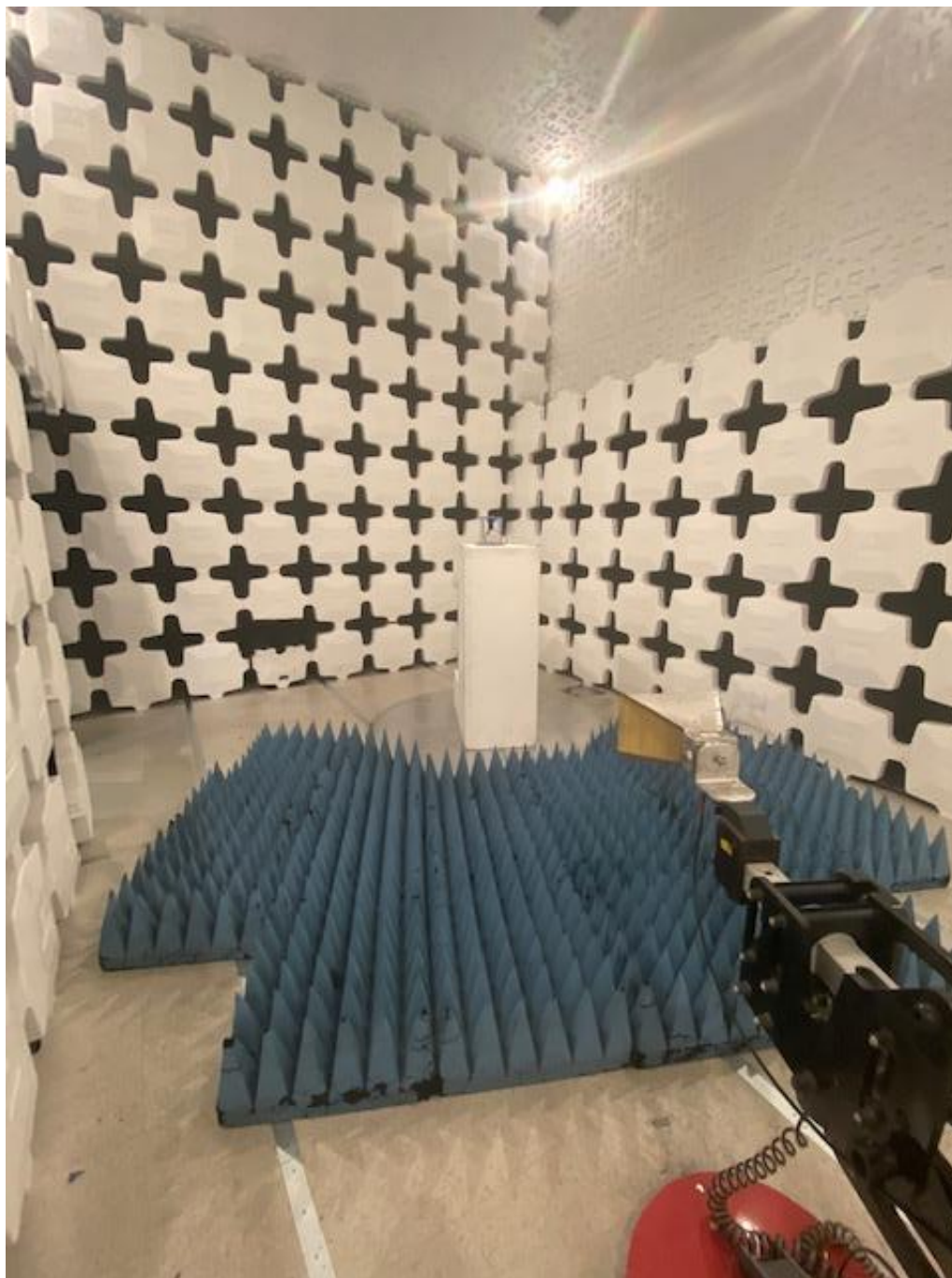
Figure 4. Radiated Emissions, above 1 GHz

FCC Part 15 Class II Permissive Change P2SR900CE 4171B-R900CE 21-0048 April 8, 2021 Neptune Technology Group R900