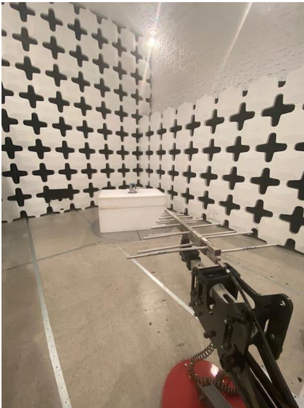
Figure 3. Radiated Emissions, 200-1000 MHz

FCC Part 15 Class II Permissive Change P2SR900CE 4171B-R900CE 21-0048 April 8, 2021 Neptune Technology Group R900