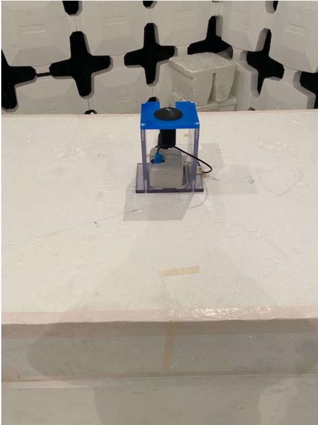
Figure 1. EUT Setup