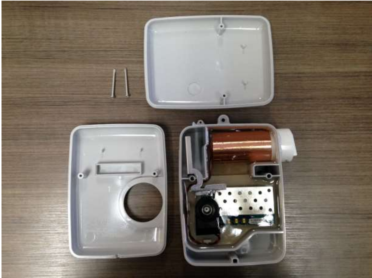
Figure 1. EUT, Case Open