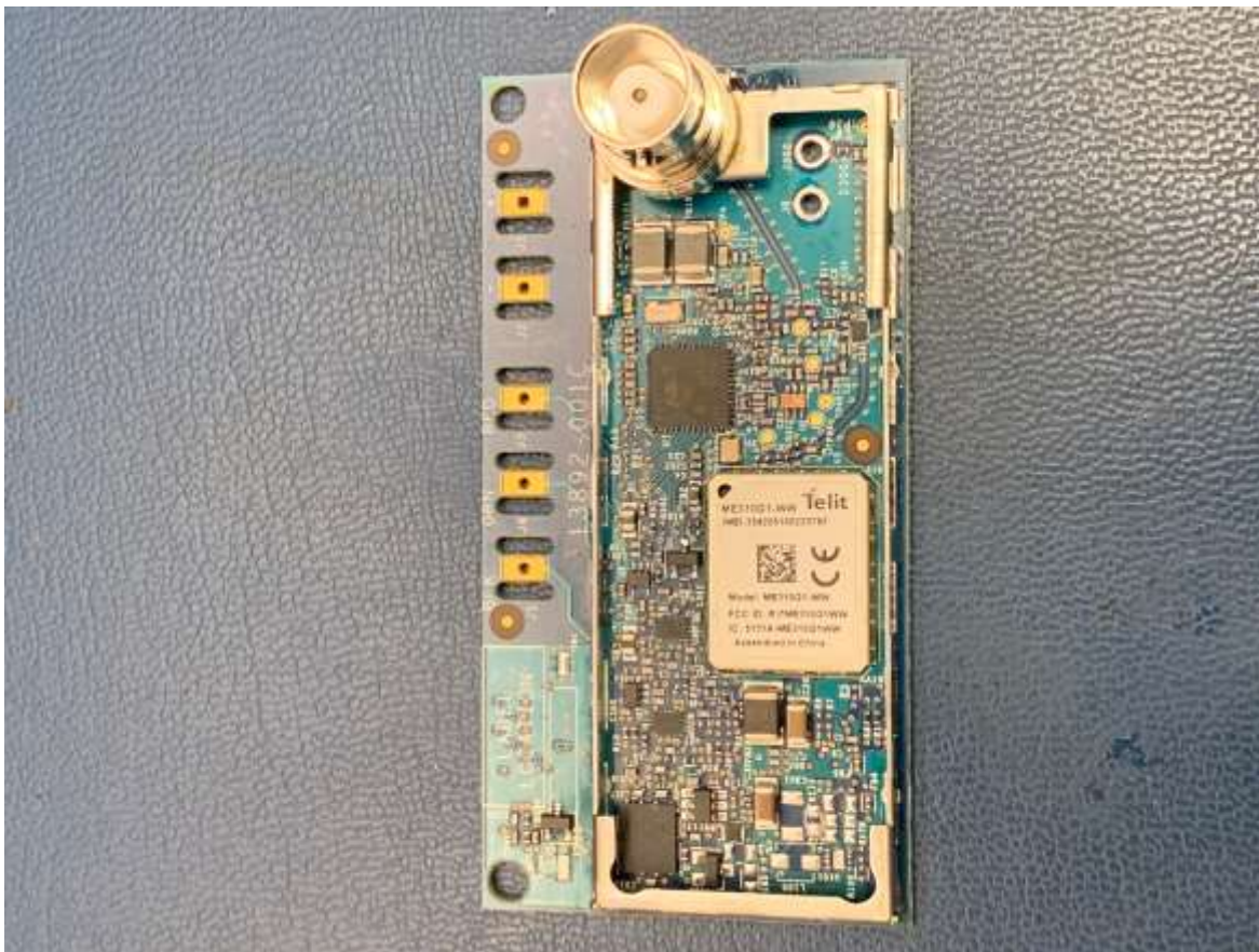
Figure 4. Top View of PCB, Shield Removed

FCC Part 15 Certification P2SR900CE 4171B-R900CE 20-0363 February 9, 2021 Neptune Technology Group, Inc. R900