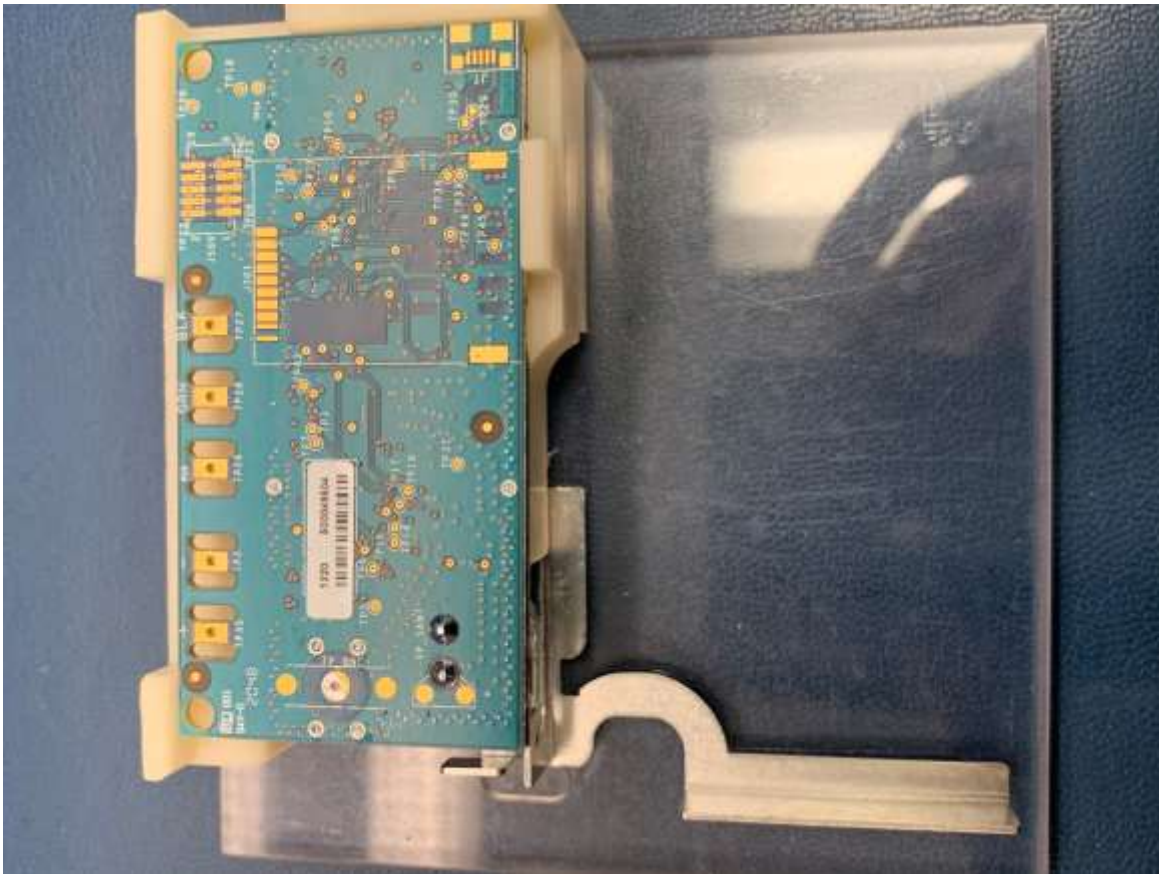
Figure 5. Bottom of PCB, with Shield and Antenna

FCC Part 15 Certification P2SR900CE 4171B-R900CE 20-0363 February 9, 2021 Neptune Technology Group, Inc. R900