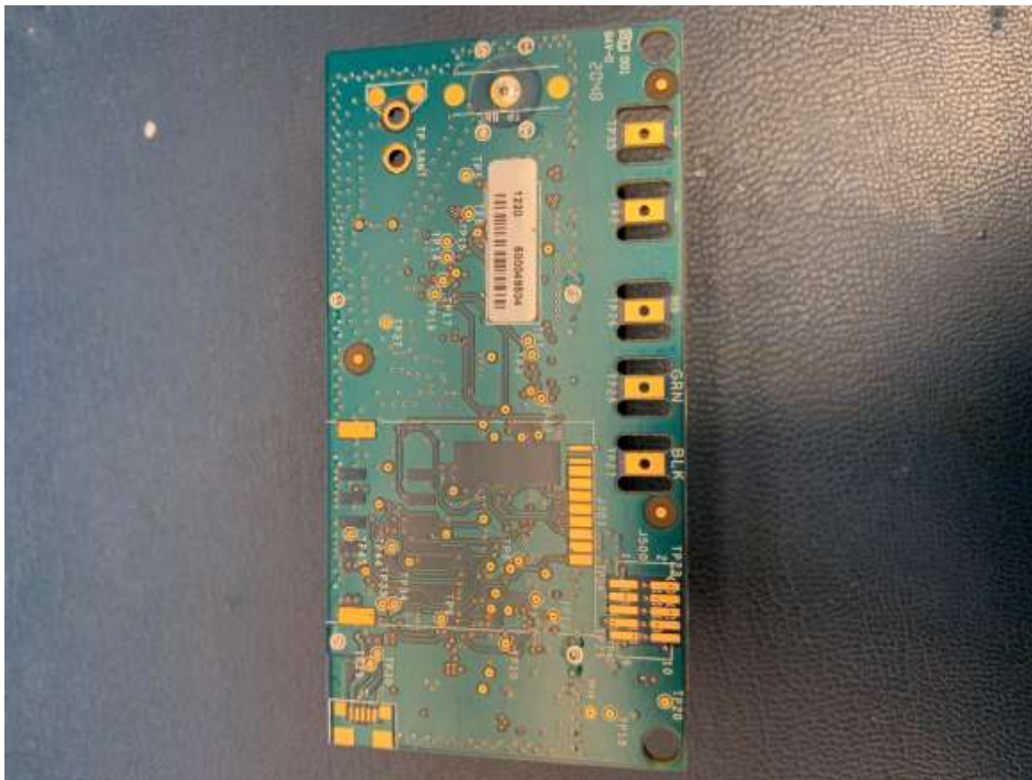
Figure 6. Bottom of PCB, Shield and Antenna Removed

FCC Part 15 Certification P2SR900CE 4171B-R900CE 20-0363 February 9, 2021 Neptune Technology Group, Inc. R900