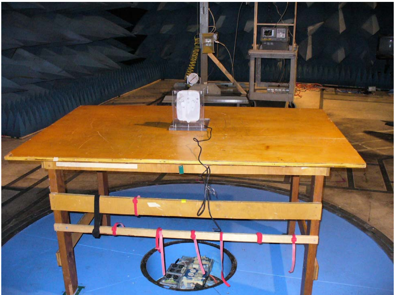
Figure 1: Radiated Emissions (Internal Antenna) – Back View