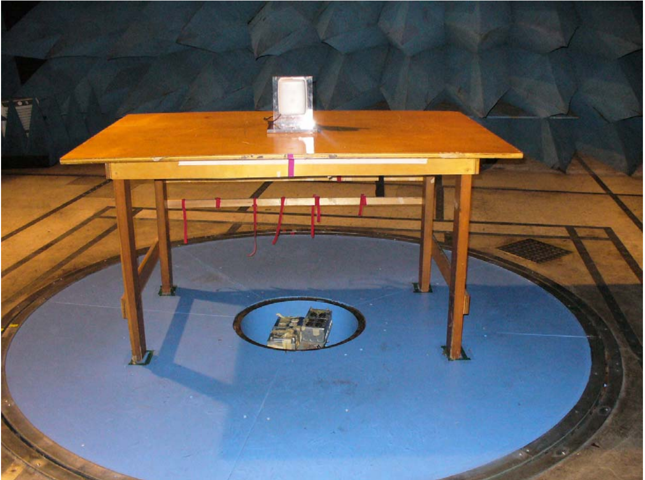
Figure 2: Radiated Emissions (Internal Antenna) – Front View