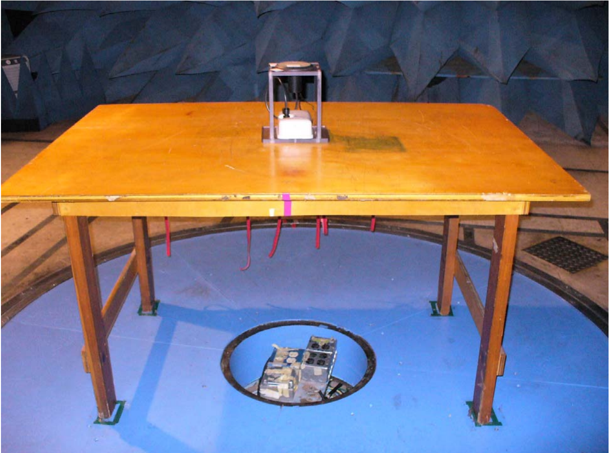
Figure 4: Radiated Emissions (External Antenna) – Front View