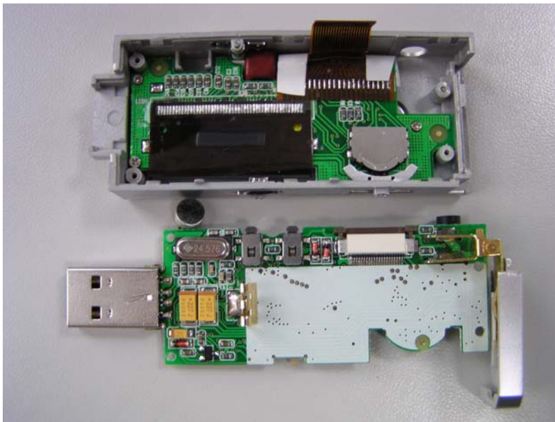
EUT - Inside View (2)