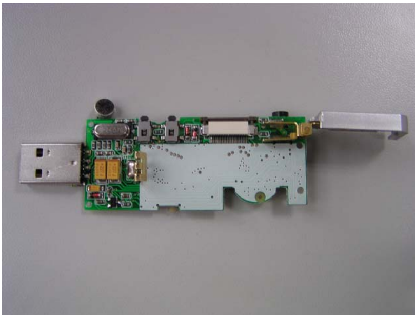
EUT -PCB View (1)