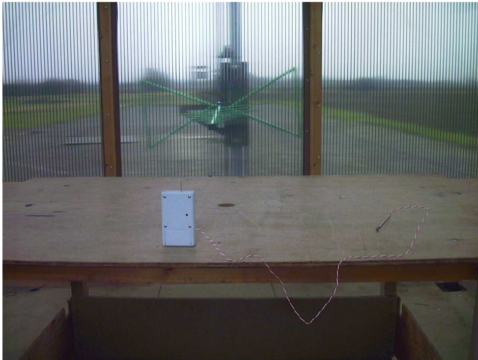
Photograph 1 General Arrangement of EUT - Back