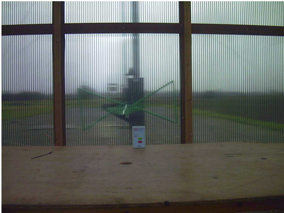
Photograph 2 General Arrangement of EUT - Front