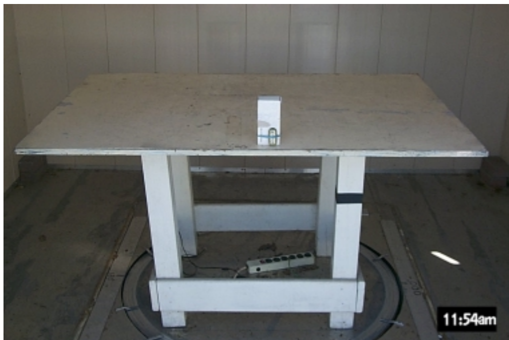
Figure 3.3 Radiated Test Setup, Position 3