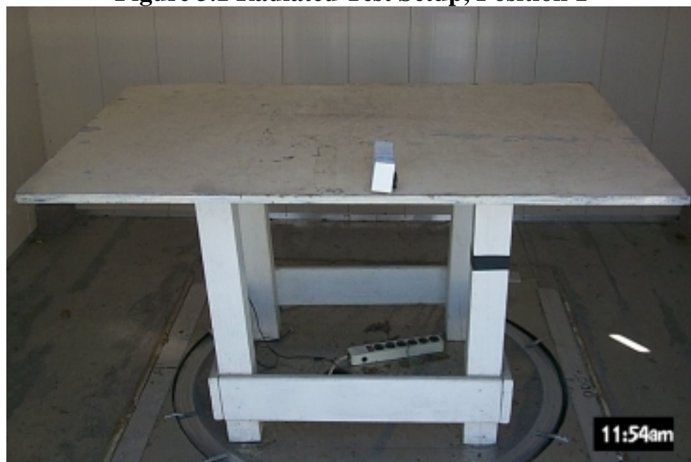
Figure 3.2 Radiated Test Setup, Position 2