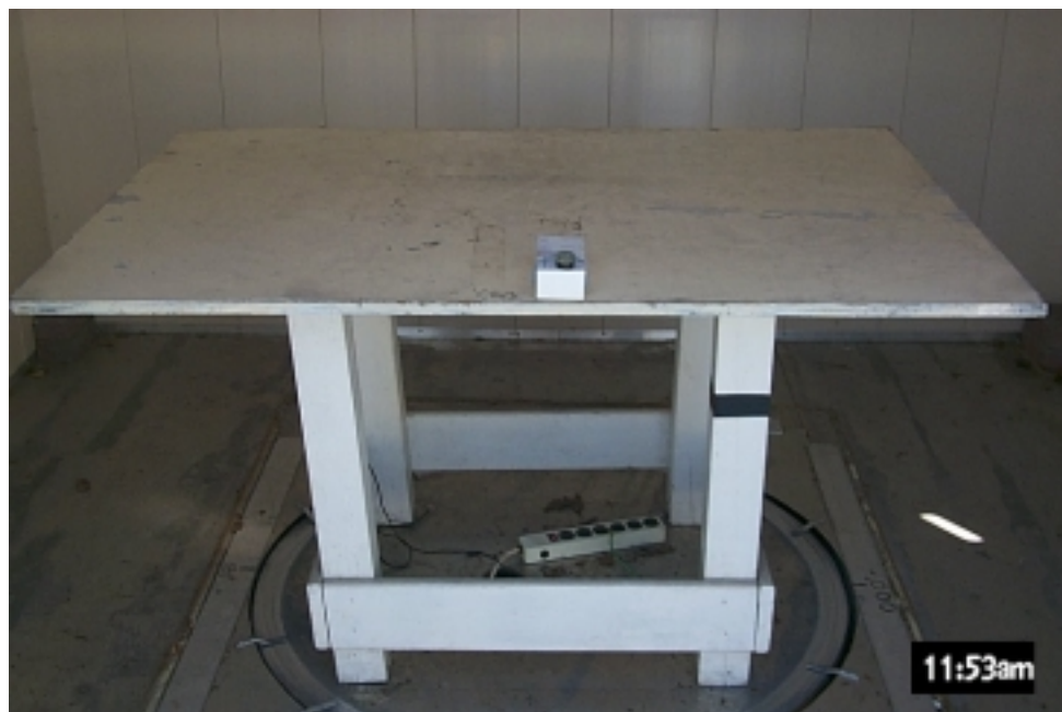
Figure 3.1 Radiated Test Setup, Position 1