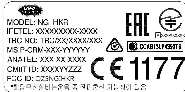
LABEL 부착 위치