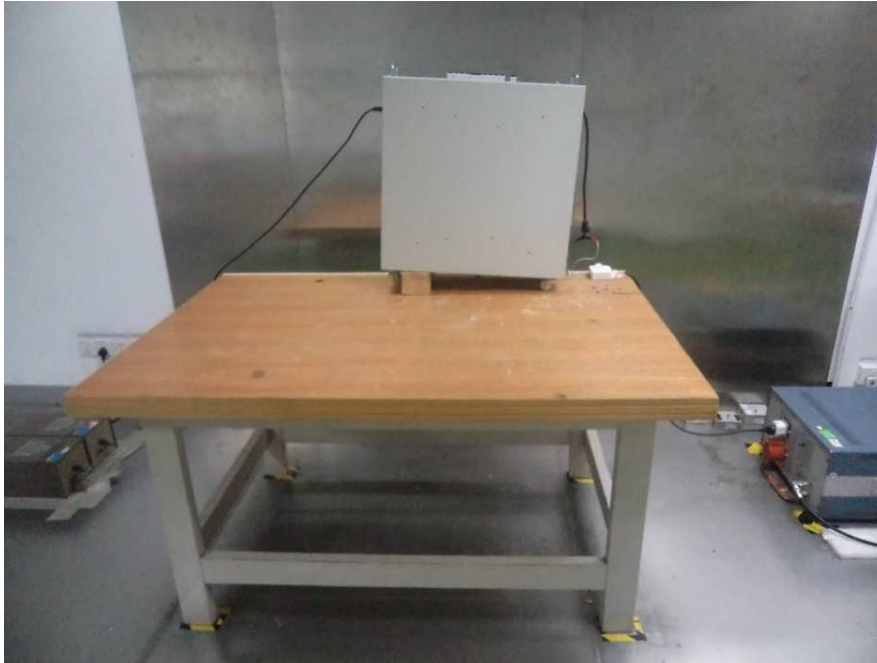
Conducted Emissions - Side View (Capacitive Load)