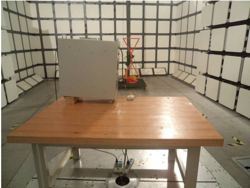
Below 1 GHz: Radiated Emissions View (Incandescent Lamp)