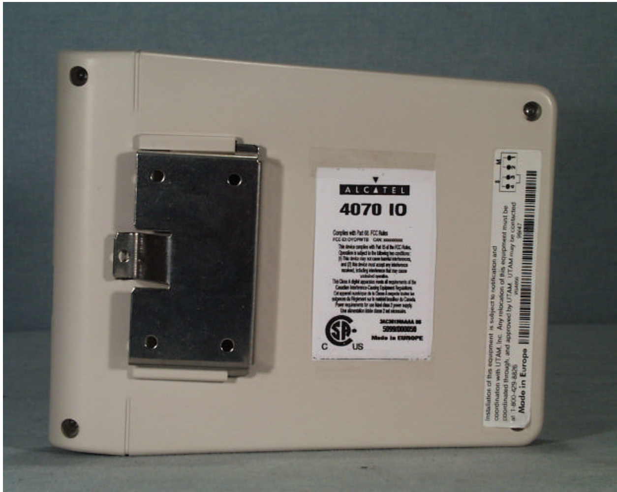
Photograph showing label placement