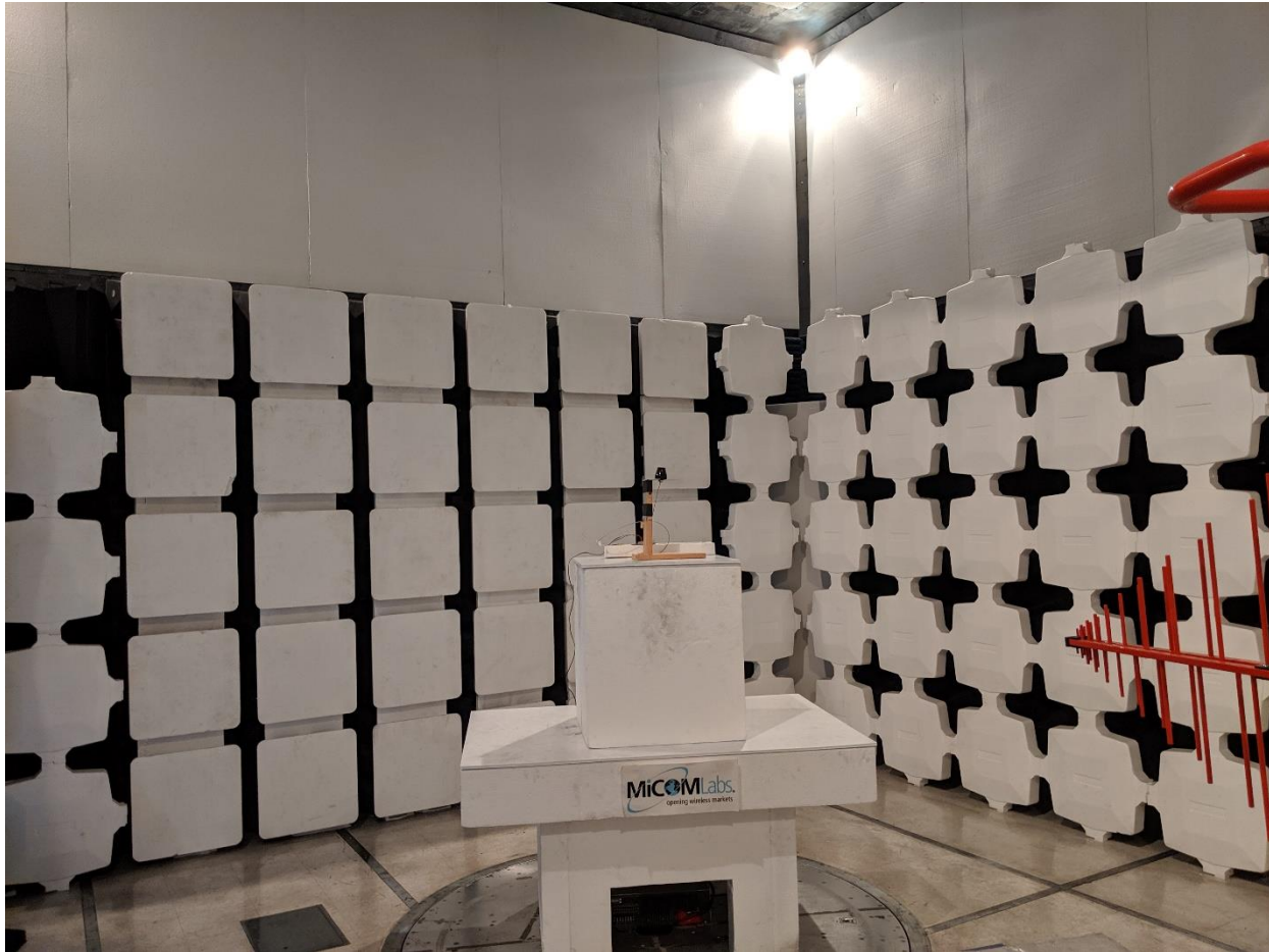
Radiated Spurious Emissions 30MHz-1GHz