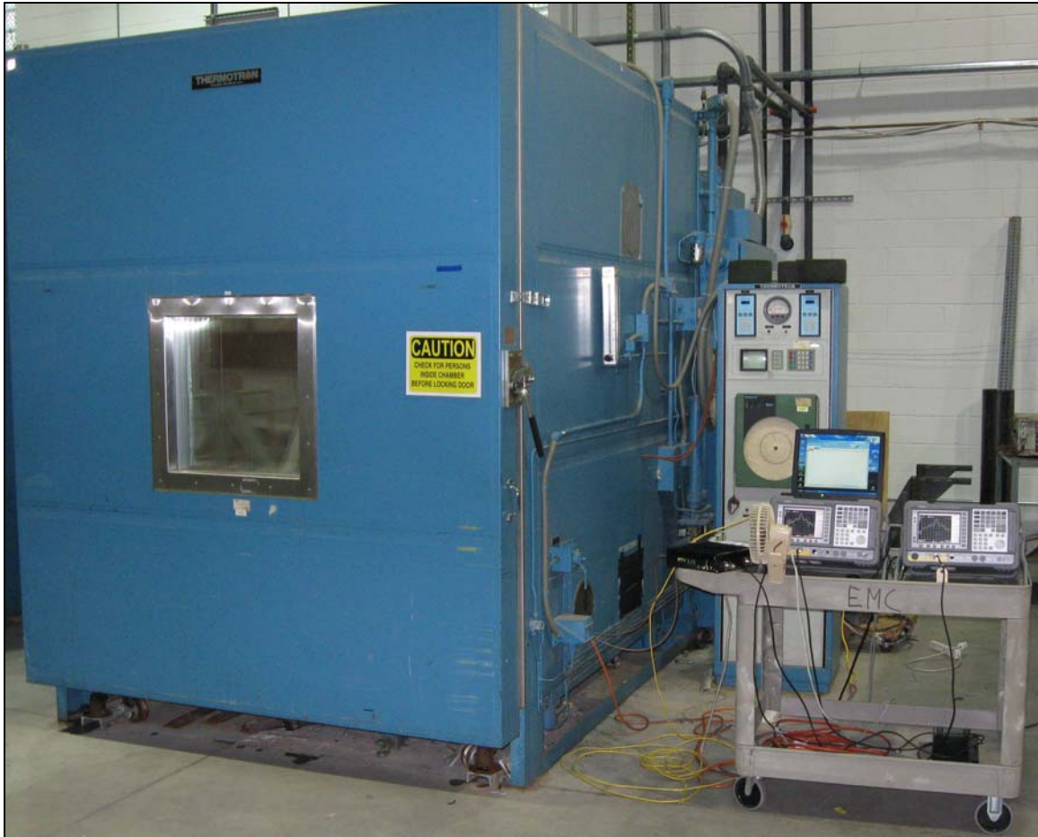
Photograph 3. Temperature Stability Test Setup