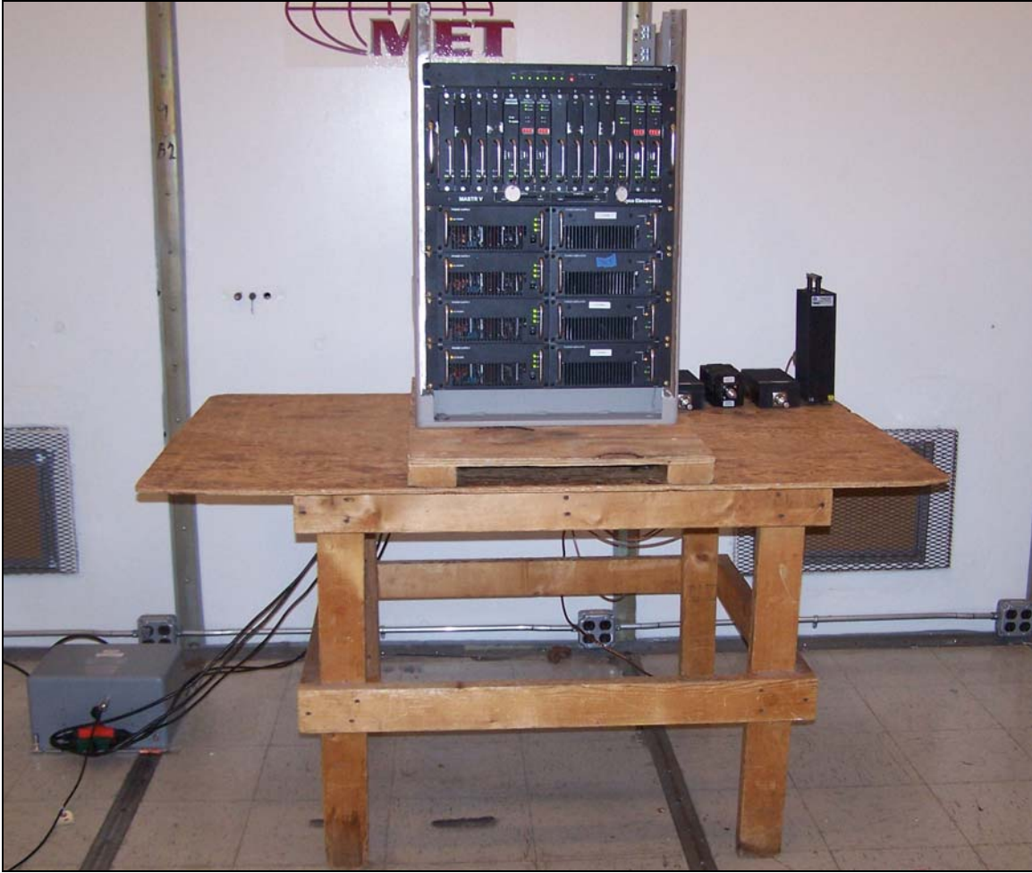
Photograph 1. Conducted Emissions