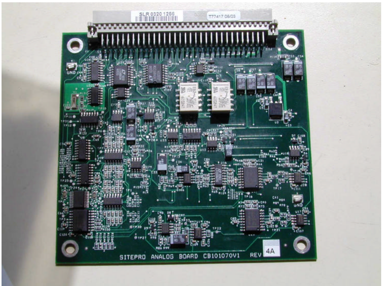
Figure 1 SitePro analog board (component side)