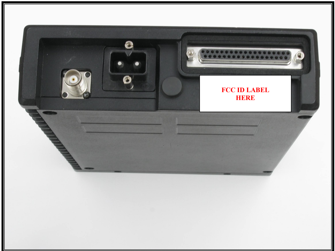
PHOTOGRAPH 1: LABEL LOCATION ON BACK OF EUT