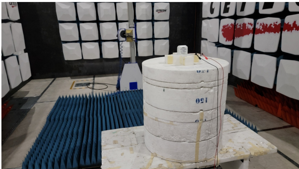
1GHz to 3GHz Rear View