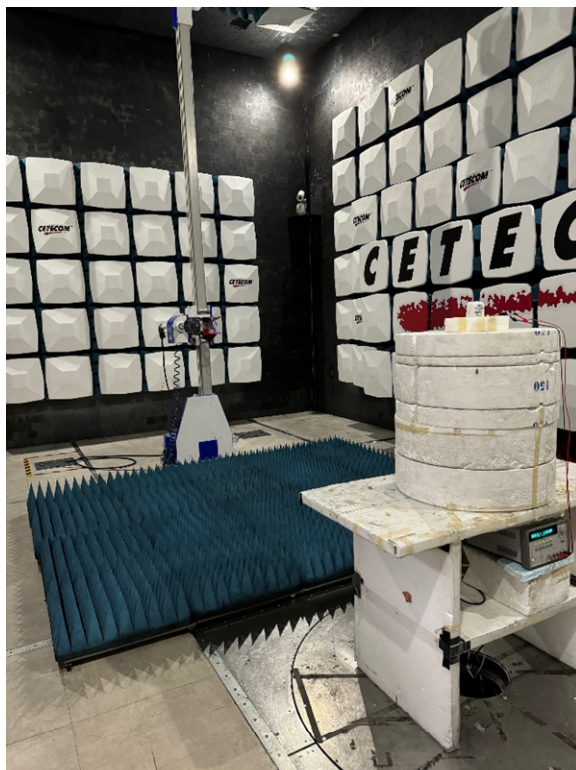
3GHz to 18GHz Rear View