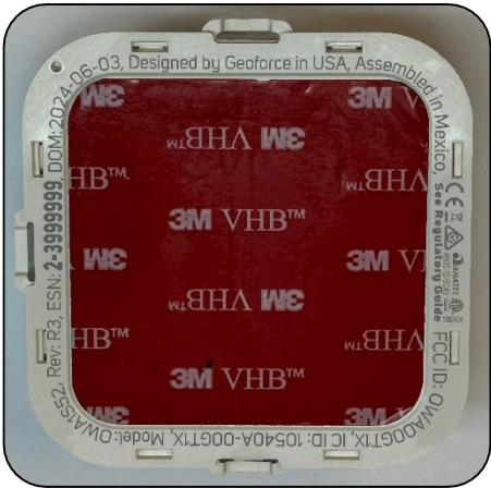
FIGURE 3: PRODUCT BOTTOM SURFACE

The GT1 product labeling is indelibly applied via a permanent laser marking process. Product identification is applied on the bottom surface of the product. Example marking layouts are provided below.