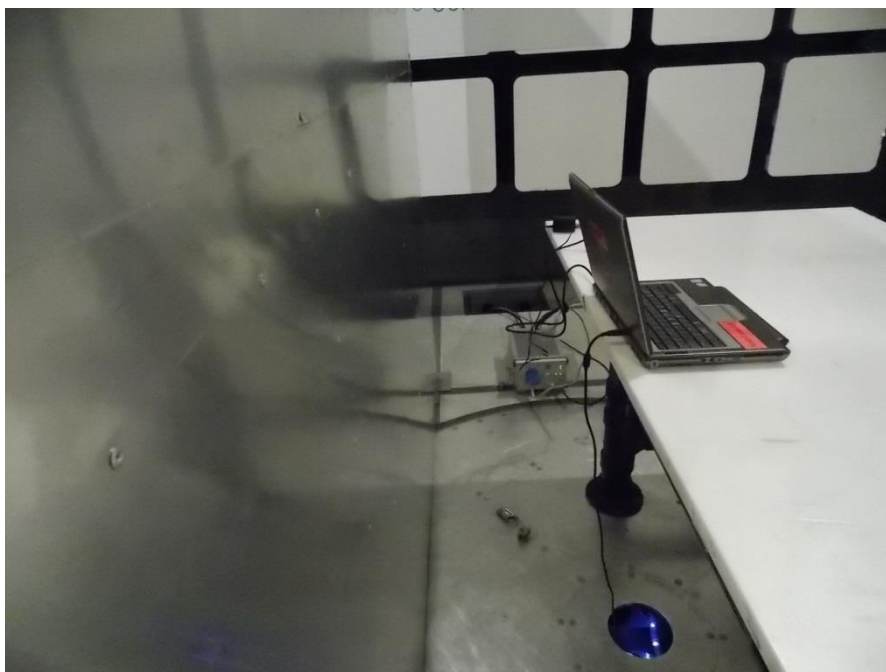
Figure 1.2-2: AC power line conducted emissions setup photo