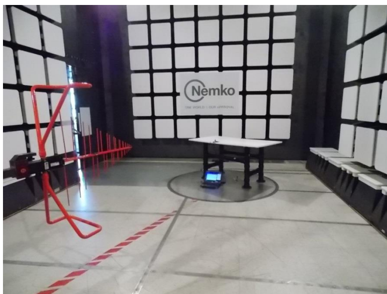
Figure 1.1-2: Field strength setup photo