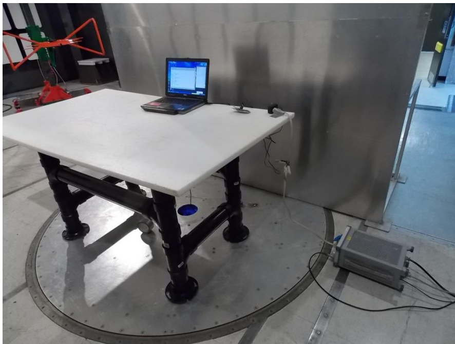
Figure 1.2-1: AC power line conducted emissions setup photo