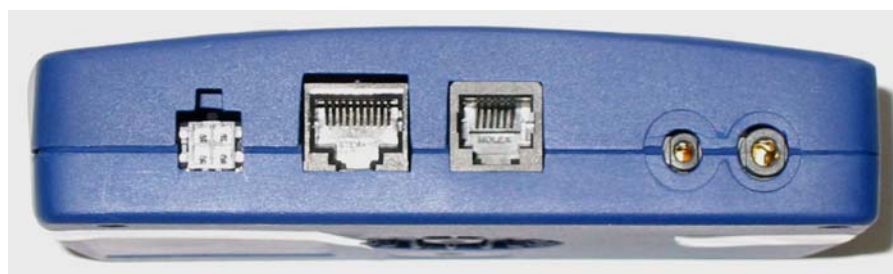
Figure 3: Connection panel (side view)