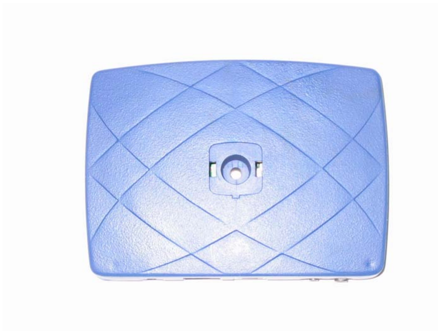
Figure 1: Cover A (top view)