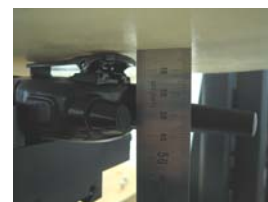
Figure 12. Body SAR