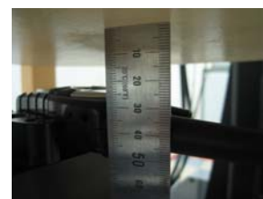
Figure 11. Mouth Face