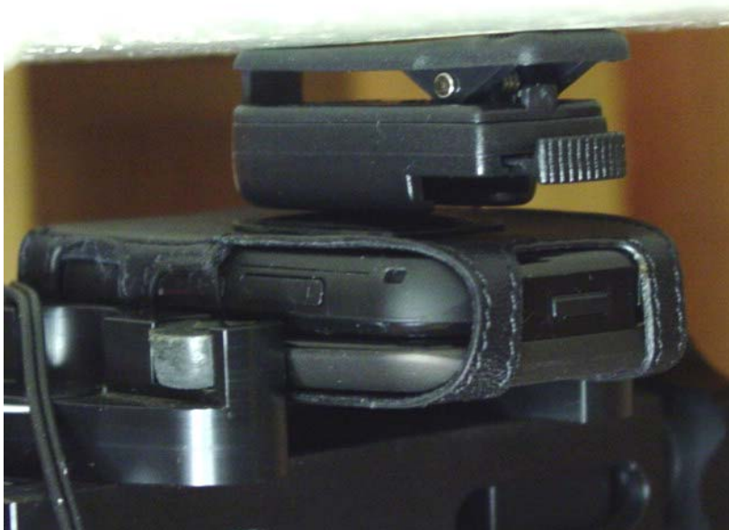
Figure 9E.5 Body SAR Phone setup Flip Closed with Leather Case (CV90-R201X-01)