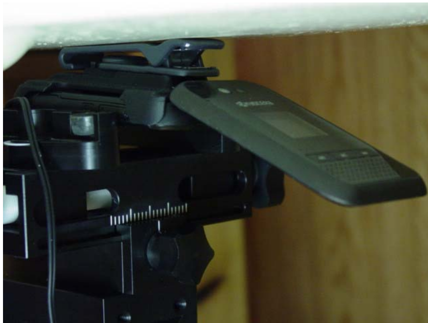
Figure 9E.7 Body SAR Phone setup Flip Open with Holster (CV90-R2091-01)