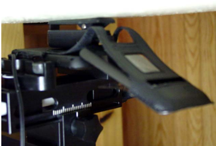
Figure 9E.5 Body SAR Phone setup Flip Open with Leather Case (CV90-R201X-01)