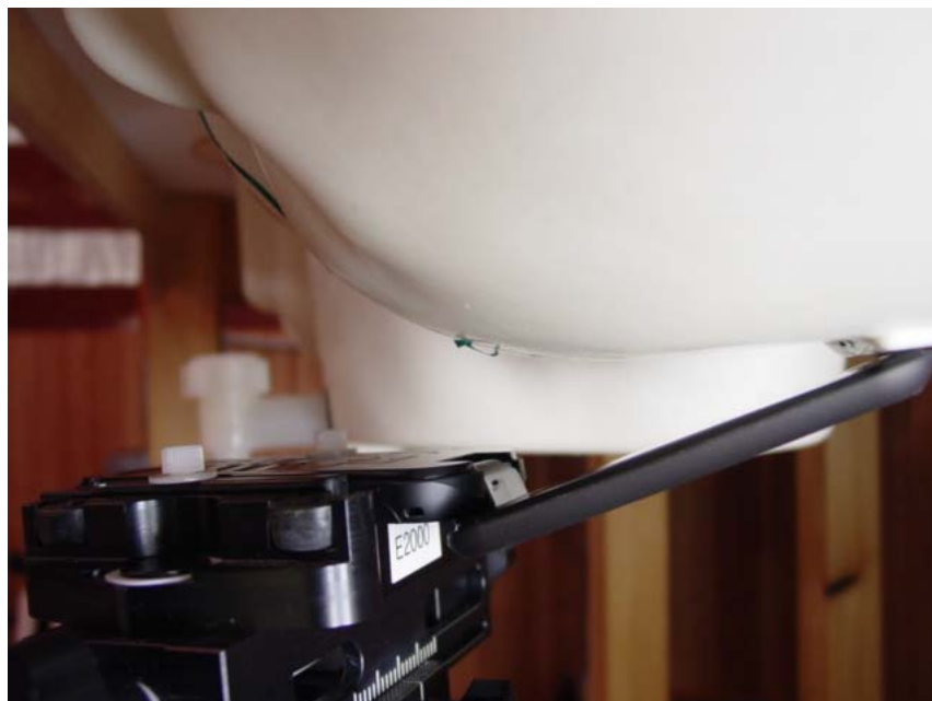
Figure 9E.2 Phone against the head (Left Tilt position)