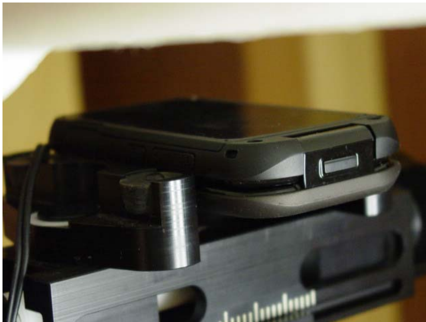
Figure 9E.3 Body SAR Phone setup Flip Closed (22.5mm Air Separation)