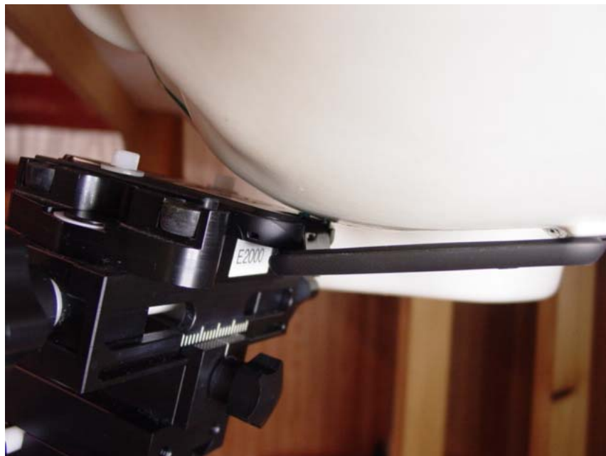
Figure 9E.1 Phone against the head (Left cheek position)