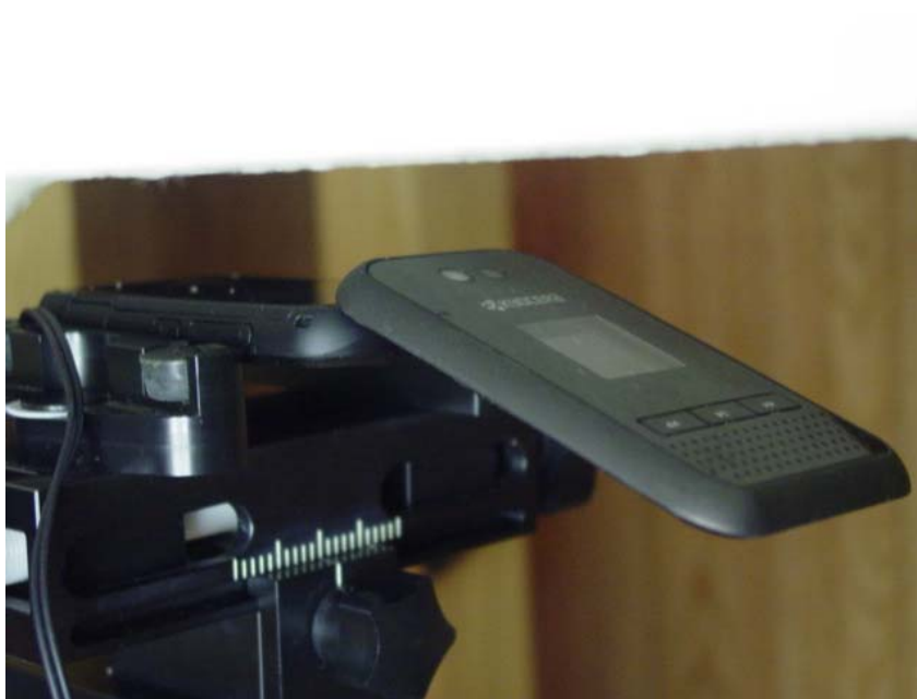
Figure 9E.4 Body SAR Phone setup Flip Closed (22.5mm Air Separation)