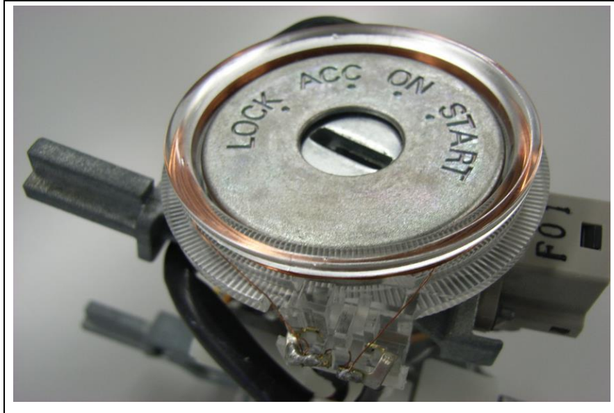
Figure 7.13 Antenna Coil (CloseUp1 View)