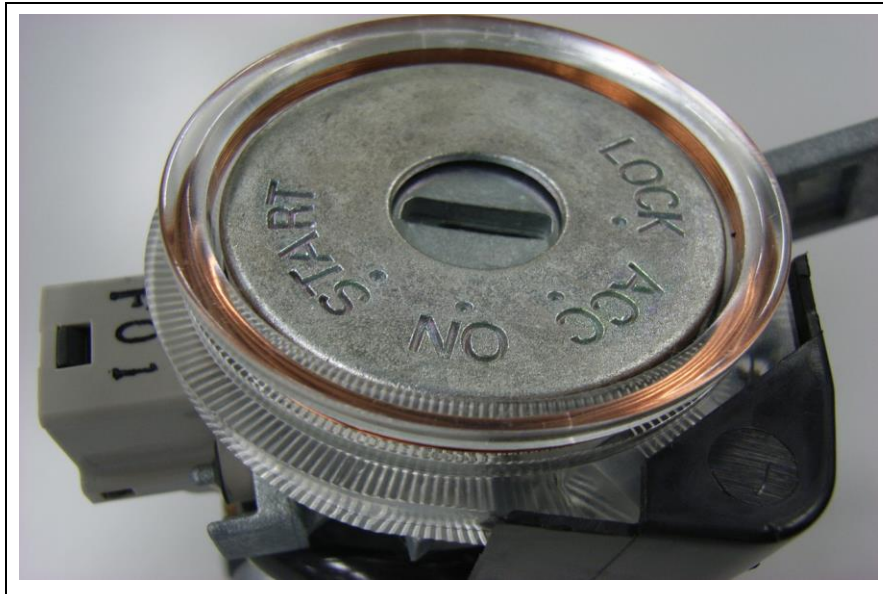
Figure 7.14 Antenna Coil (CloseUp2 View)