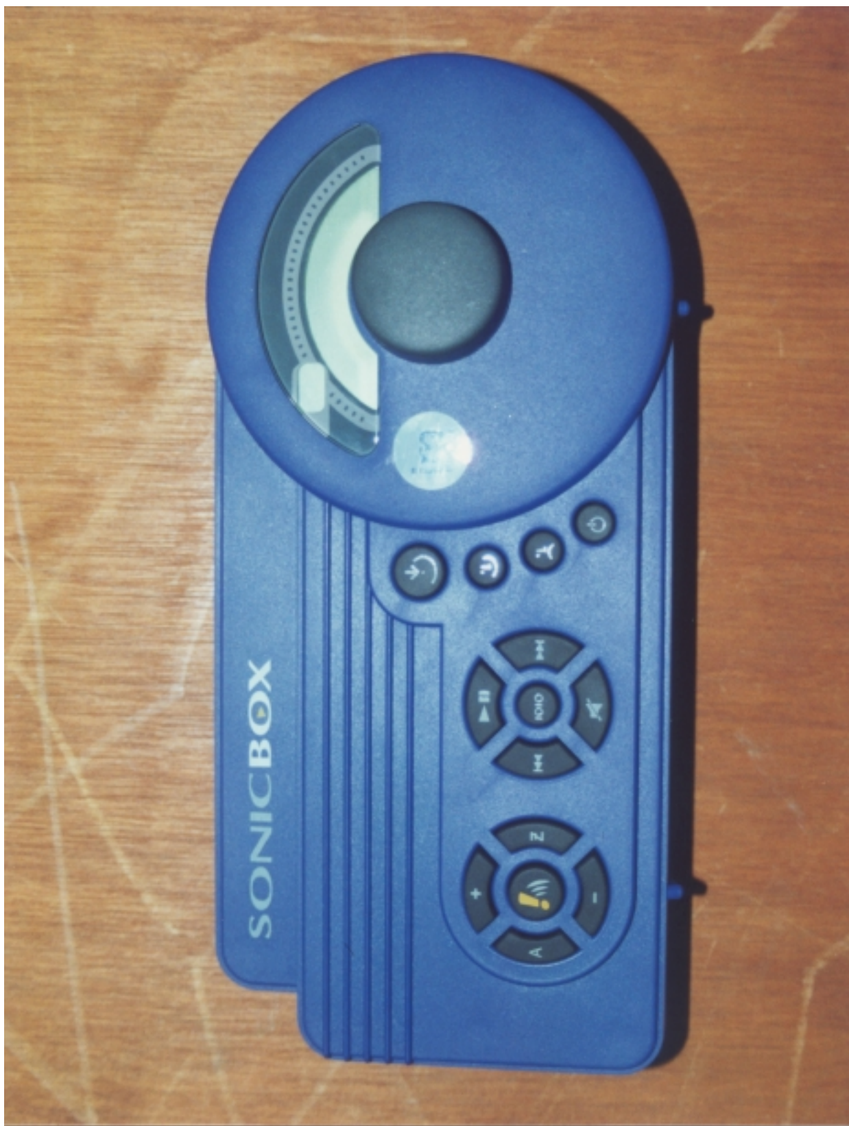
TOP VIEW OF EUT (TRANSMITTER)

1547 Plymouth Street, Mountain View, CA 94043 Tel: (650) 965-4000 Fax: (650) 965-3000