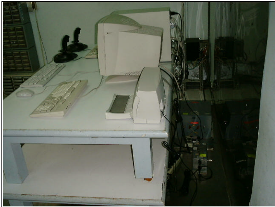
Conducted Emission Setup Photos (Worst Emission Position)