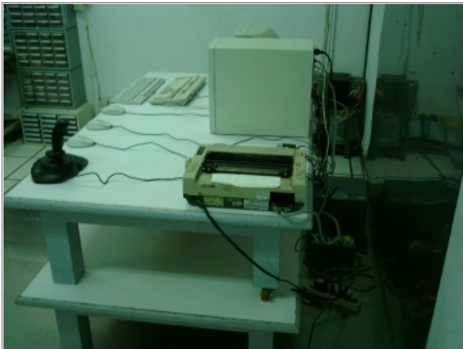
Conducted Emission Setup Photos (Worst Emission Position)