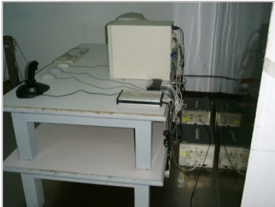
Conducted Emission Setup Photos (Worst Emission Position)