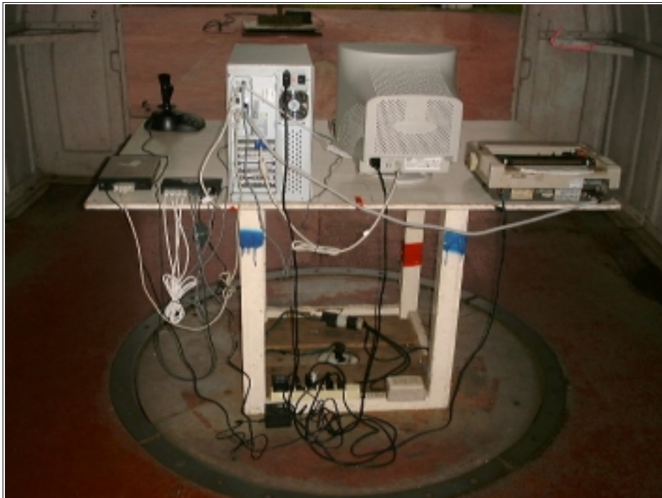
Radiated Emission Setup Photos (Worst Emission Position)