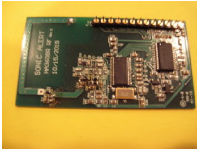
RF PCB Bottom View