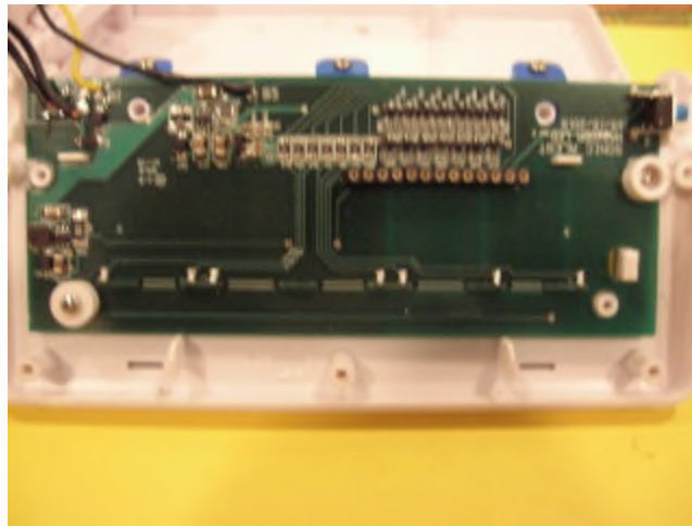
LED PCB Bottom View