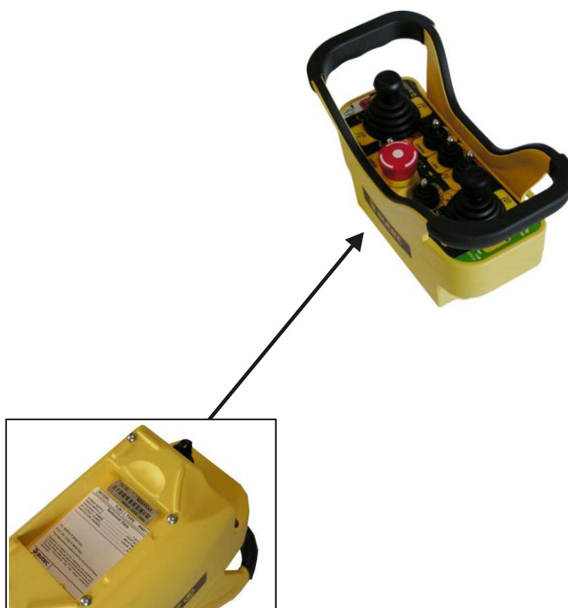
FJS label and its dimension