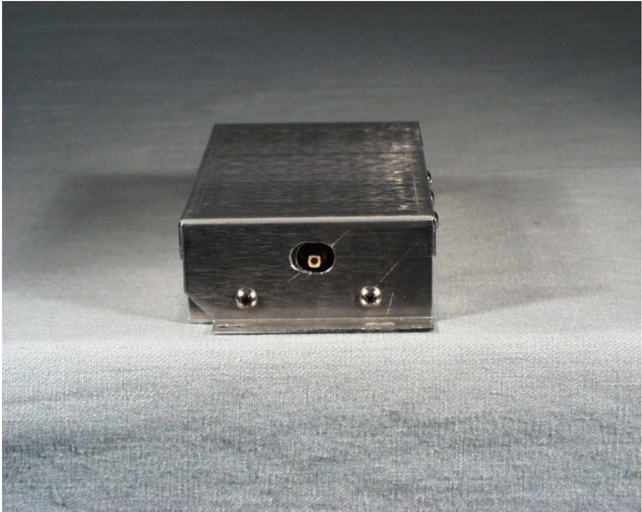
End View of the 2MOD-6322-A411 showing the antenna connector