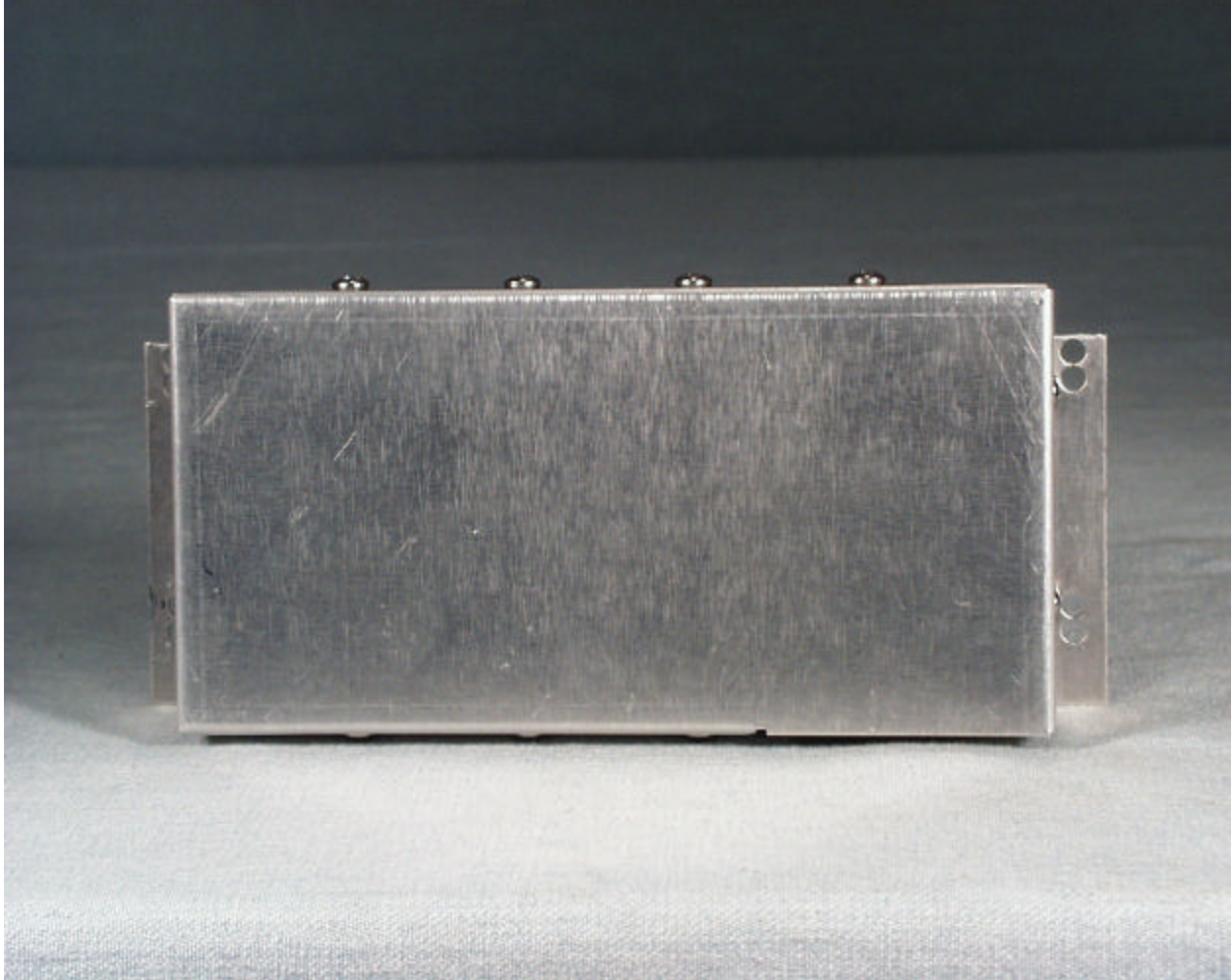
Front View of the 2MOD-6322-A411