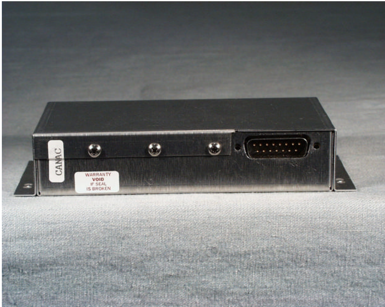
Side View of the 2MOD-6322-A411 showing the RS-232 connector