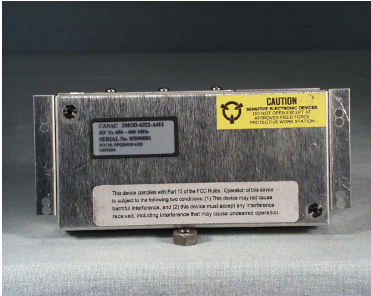
Photograph showing label placement