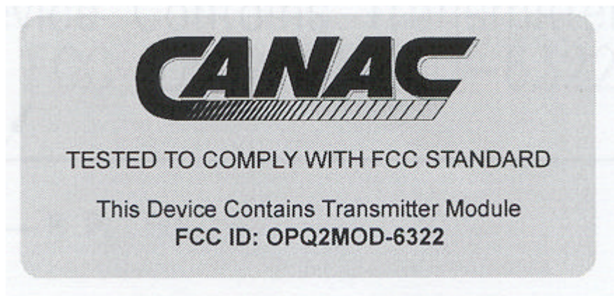
Label to placed on host system