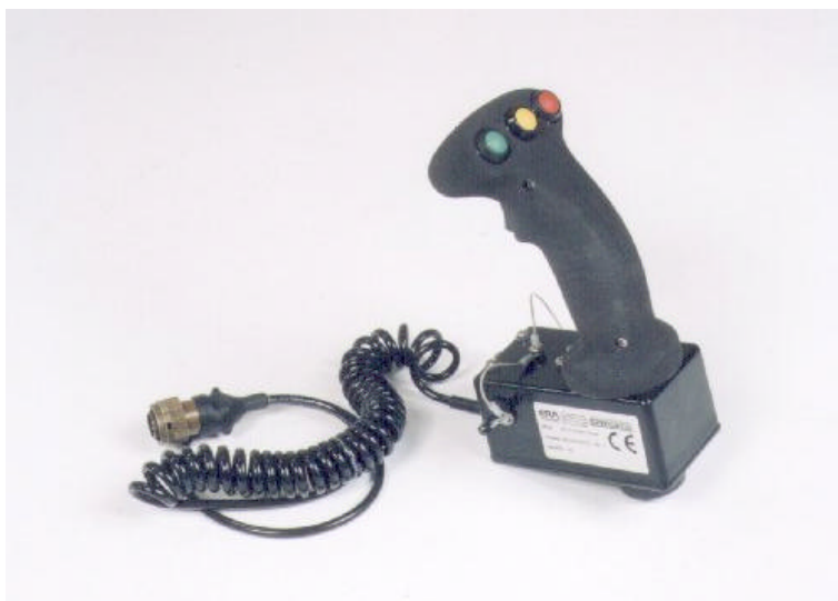
Figure 6 SPRscan function handle