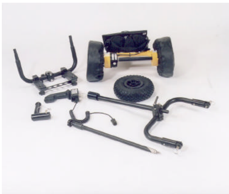
Figure 4 SPRscan trolley incorporating encoder