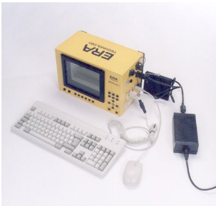
Figure 2 SPRscan controller in office mode