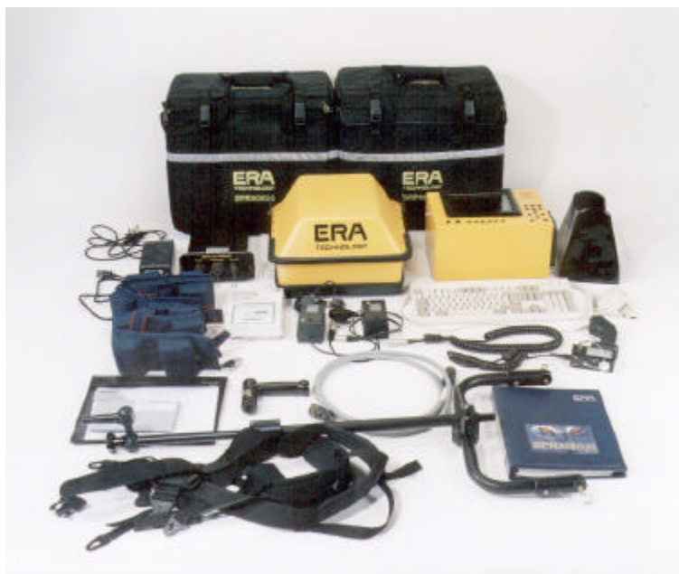
Figure 1 SPRscan system disassembled with 500MHz antenna