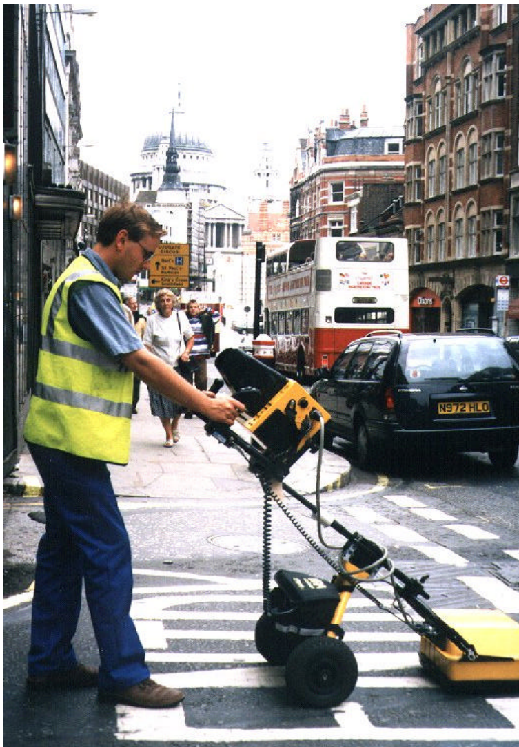
Figure 3 SPRscan with 500MHz antenna in use