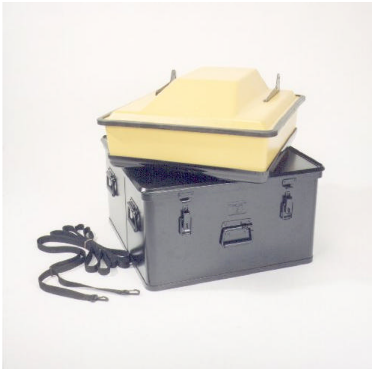
Figure 7 250MHZ antenna