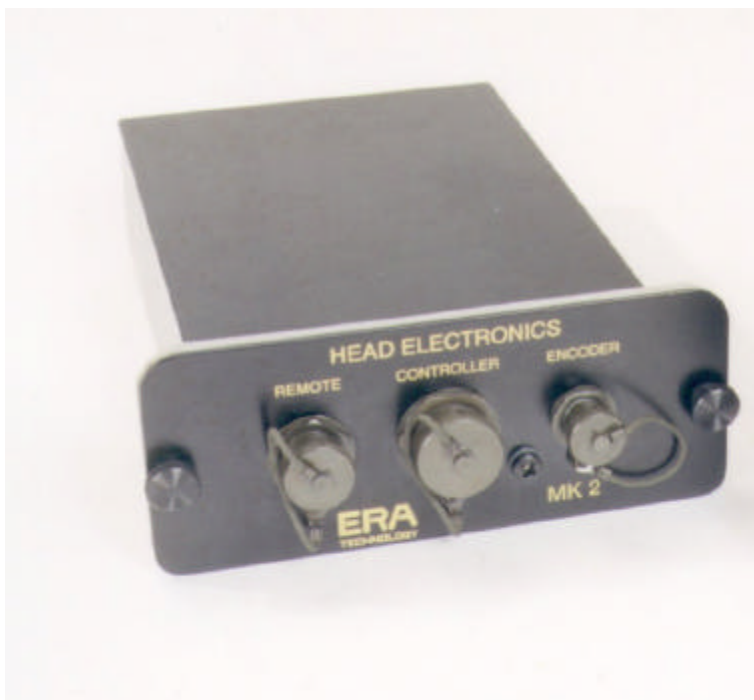
Figure 5 SPRscan head electronics