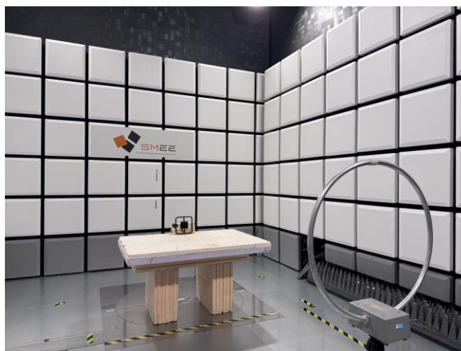
Test setup in semi anechoic room, Measurement < 30MHz (Pre-scan measurement)