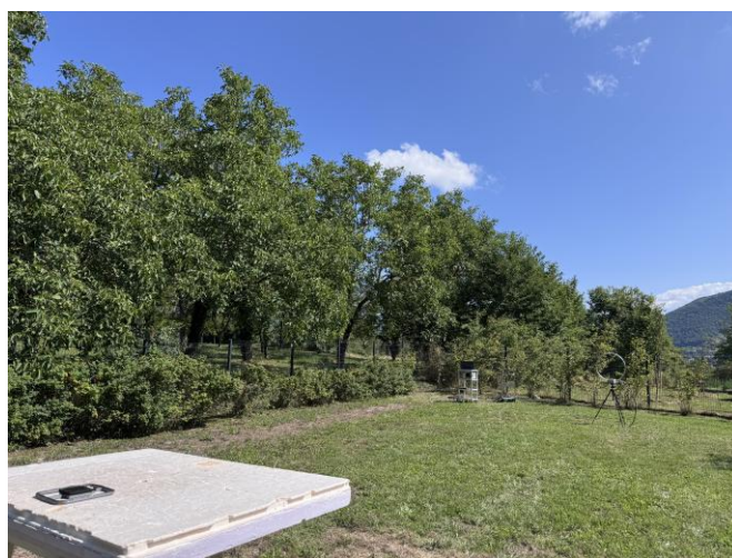
Test setup in Open Area Test Site (OATS), Measurement < 30MHz