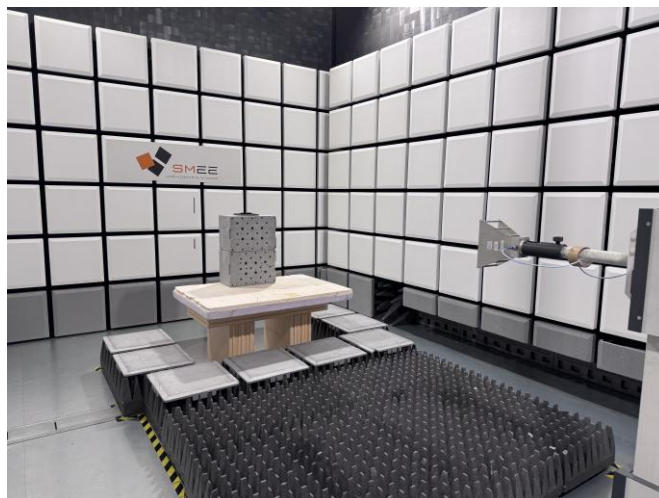
Measurement > 1GHz, in full anechoic room (semi anechoic room with absorbers on the floor)