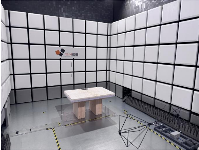
Test setup in semi anechoic room 30MHz-200MHz