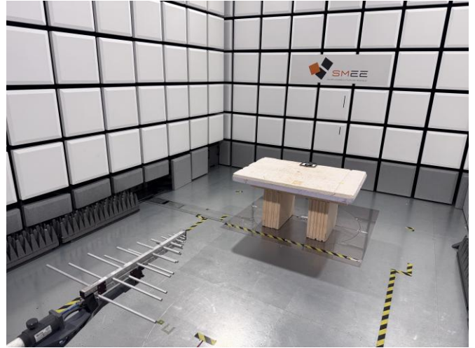
Test setup in semi anechoic room 200MHz-1GHz