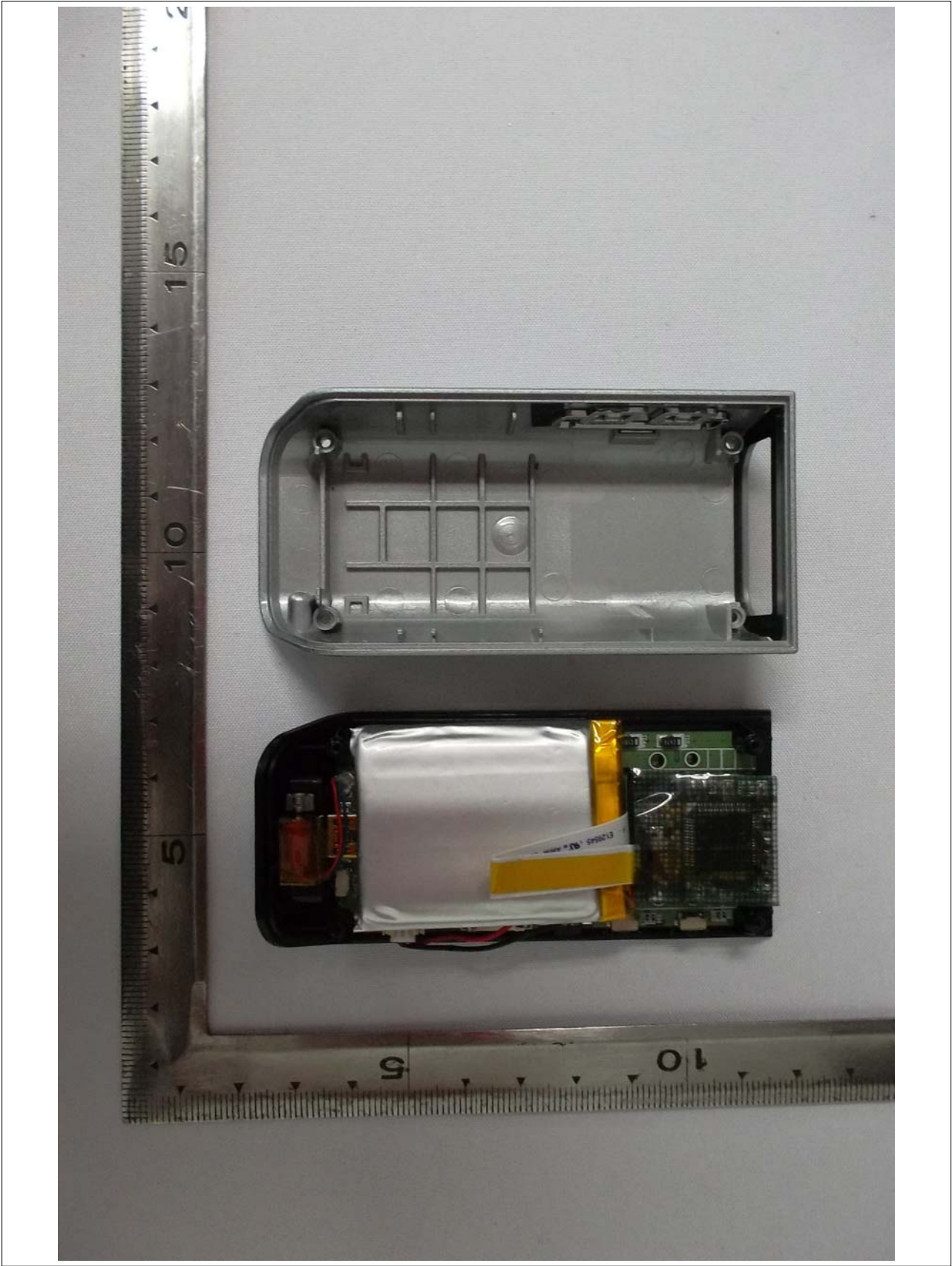
Internal view of EUT - Shield Cover mounting state