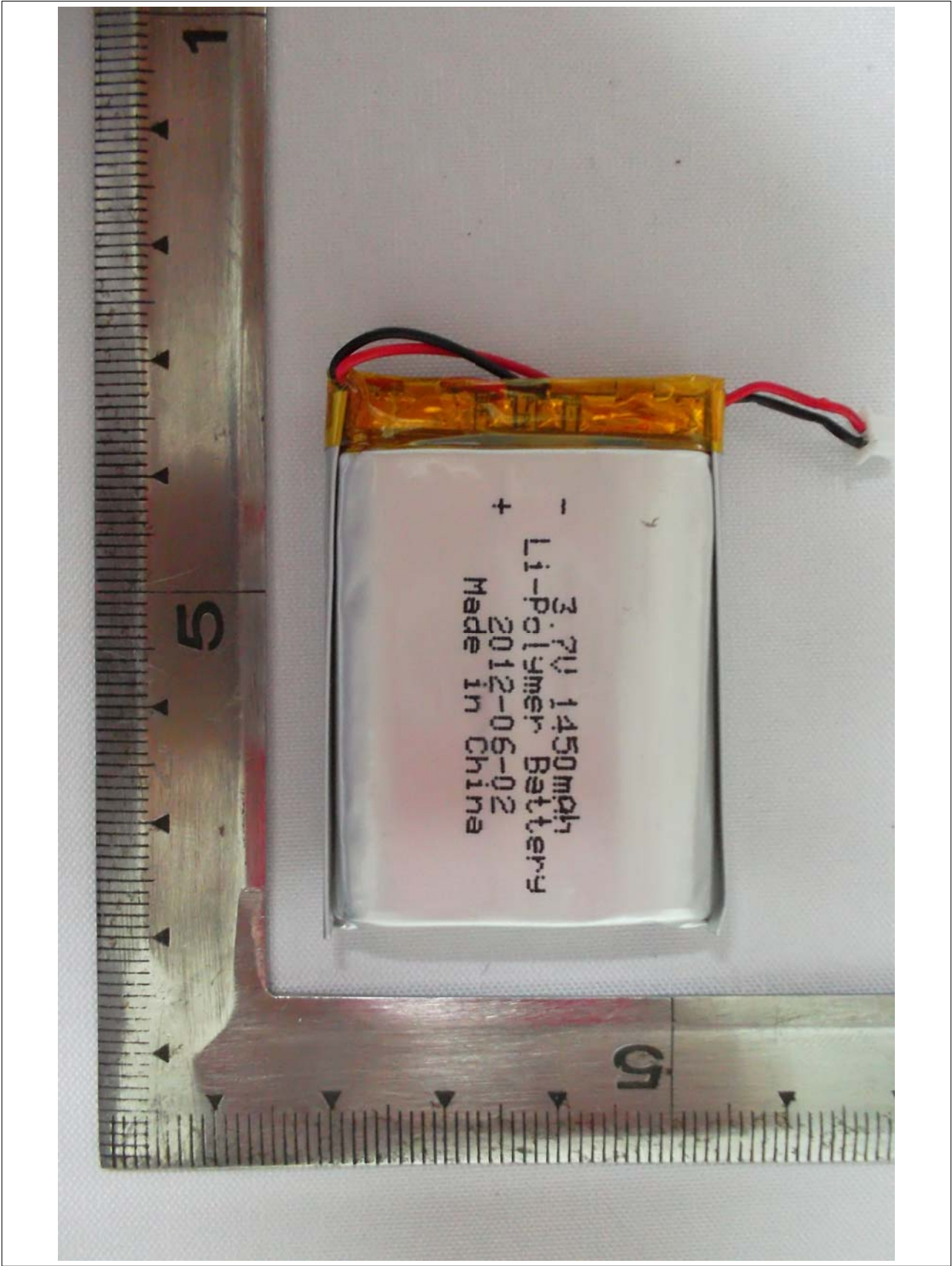
View of Battery(Top)