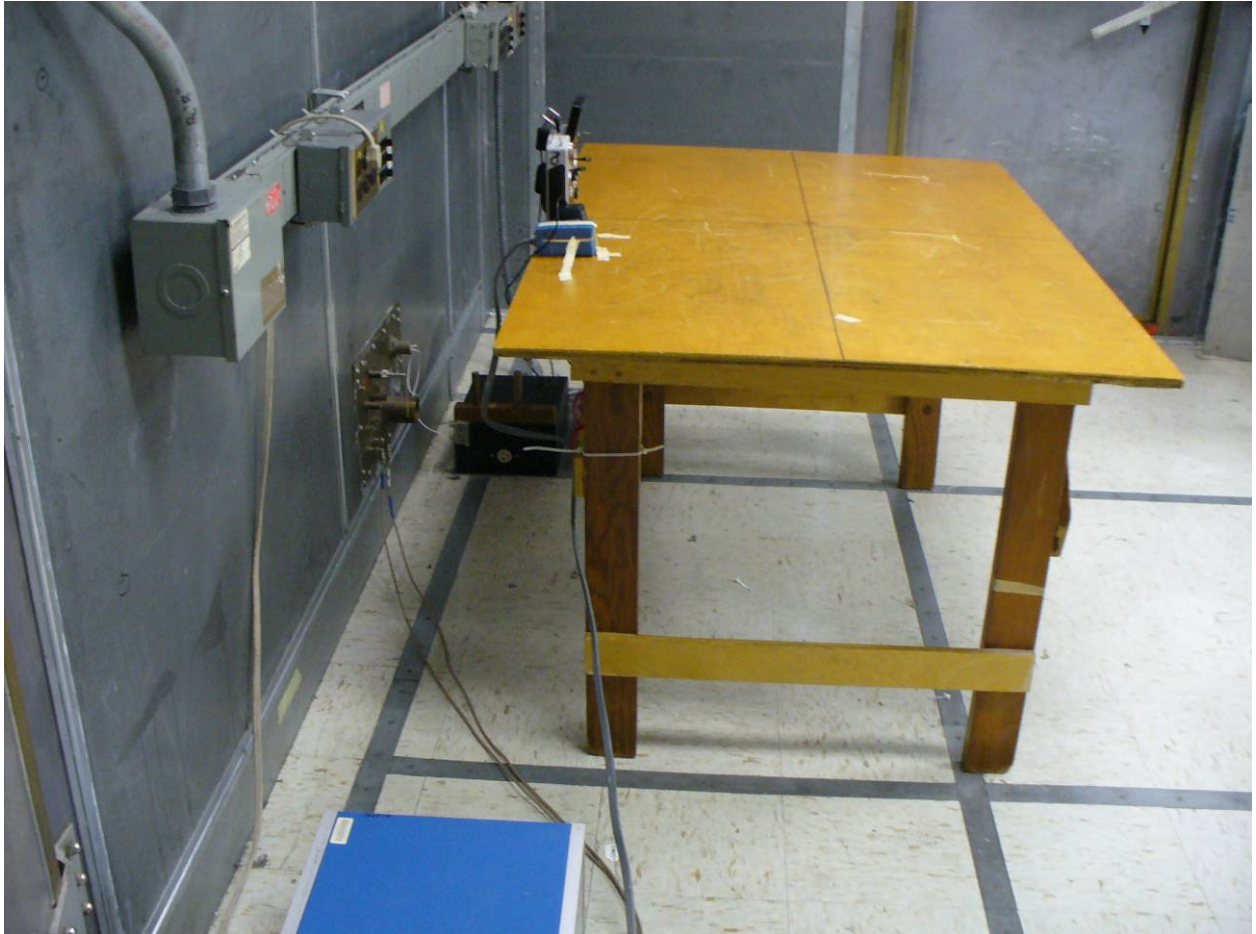
Figure 5: Power Line Conducted Emissions – Side View