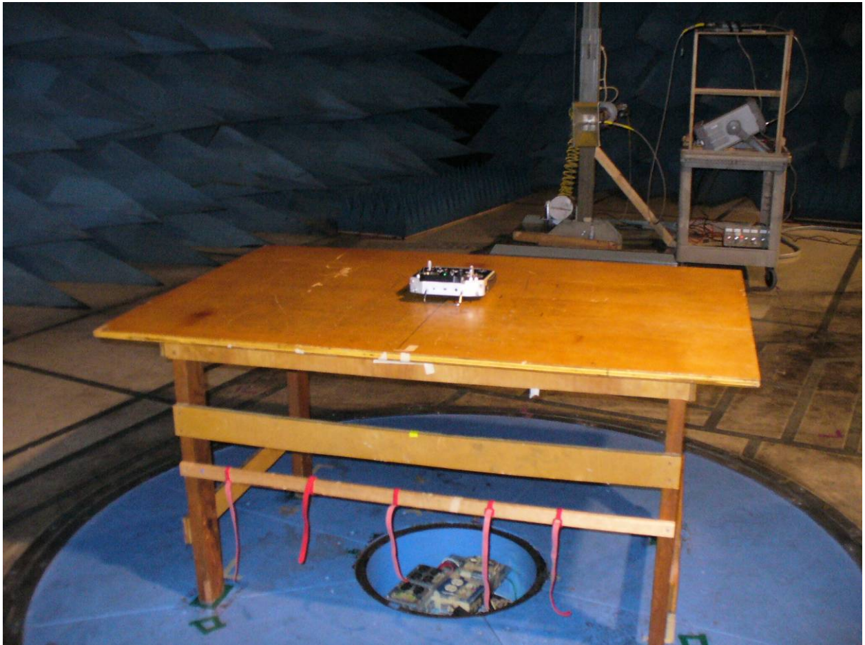
Figure 2: Radiated Emissions – Back View