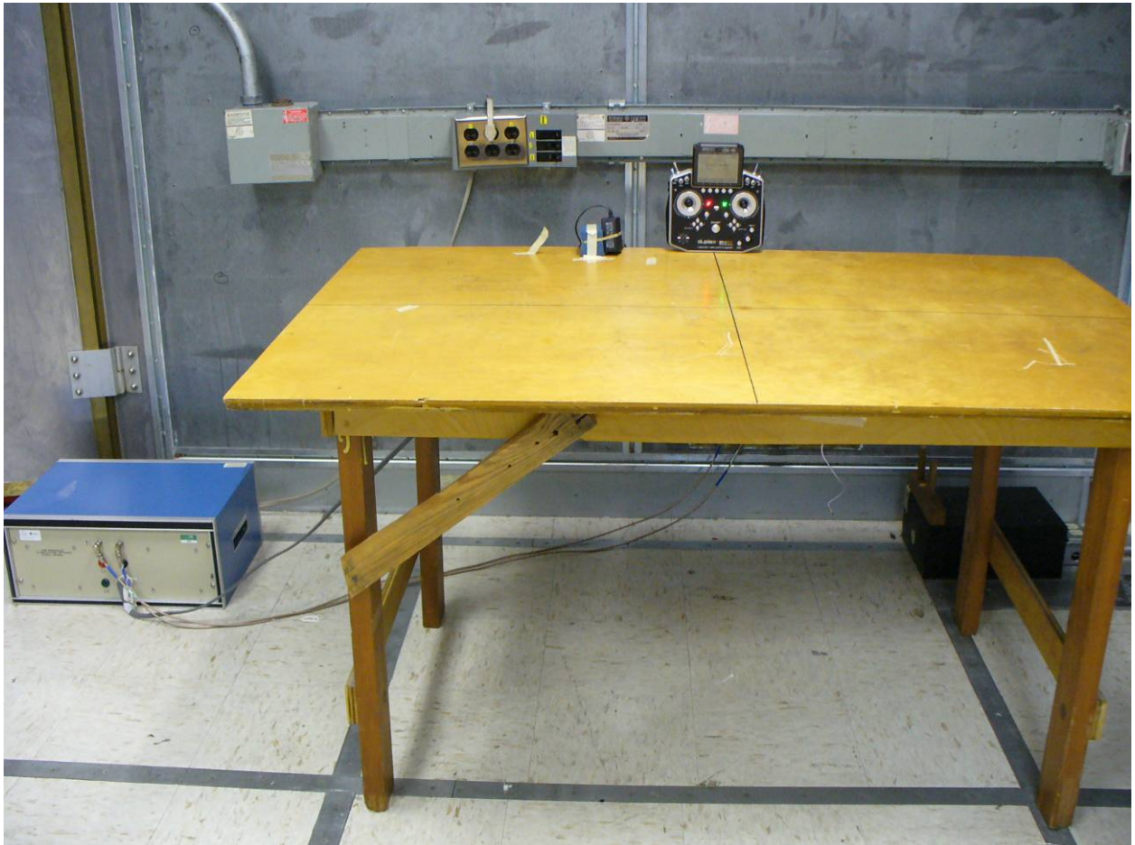
Figure 4: Power Line Conducted Emissions – Front View