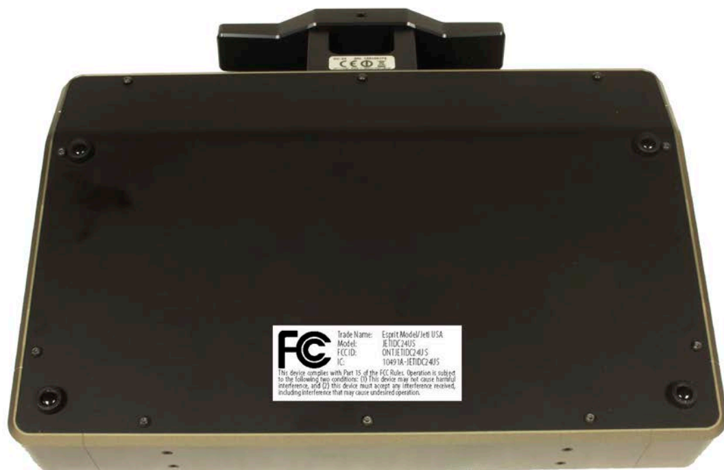
Figure 2: Sample Label Location