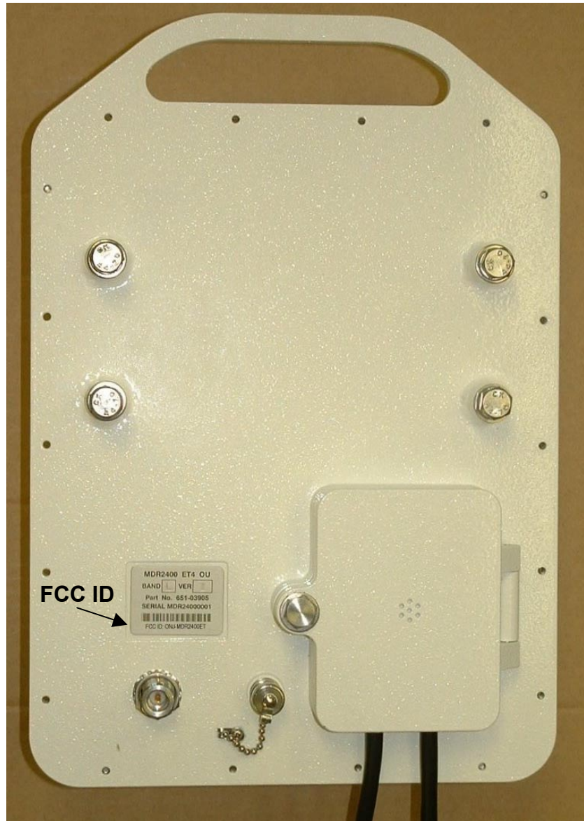
Label Placement: FCC ID Label on Back of Outdoor Unit