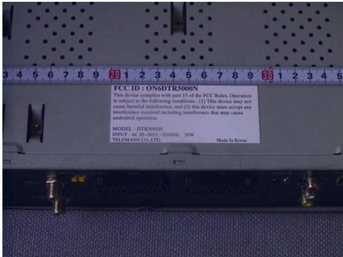
Photograph of DTR5000N FCC ID Label