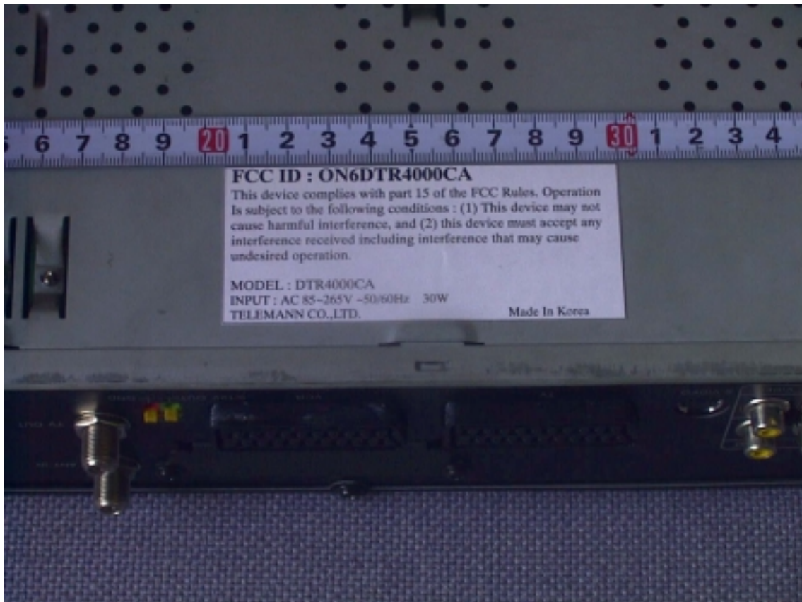
Photograph of DTR4000CA FCC ID Label