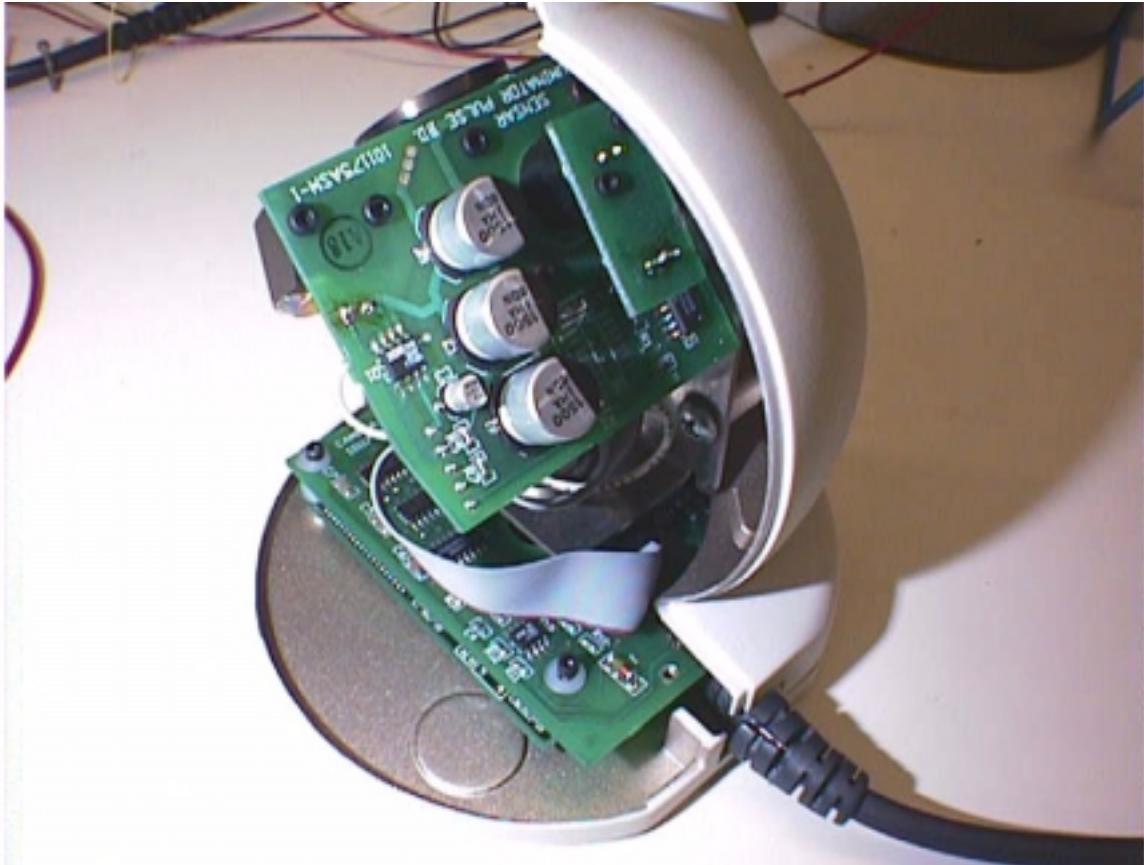
Internal Chassis and Board mounting Photo 2