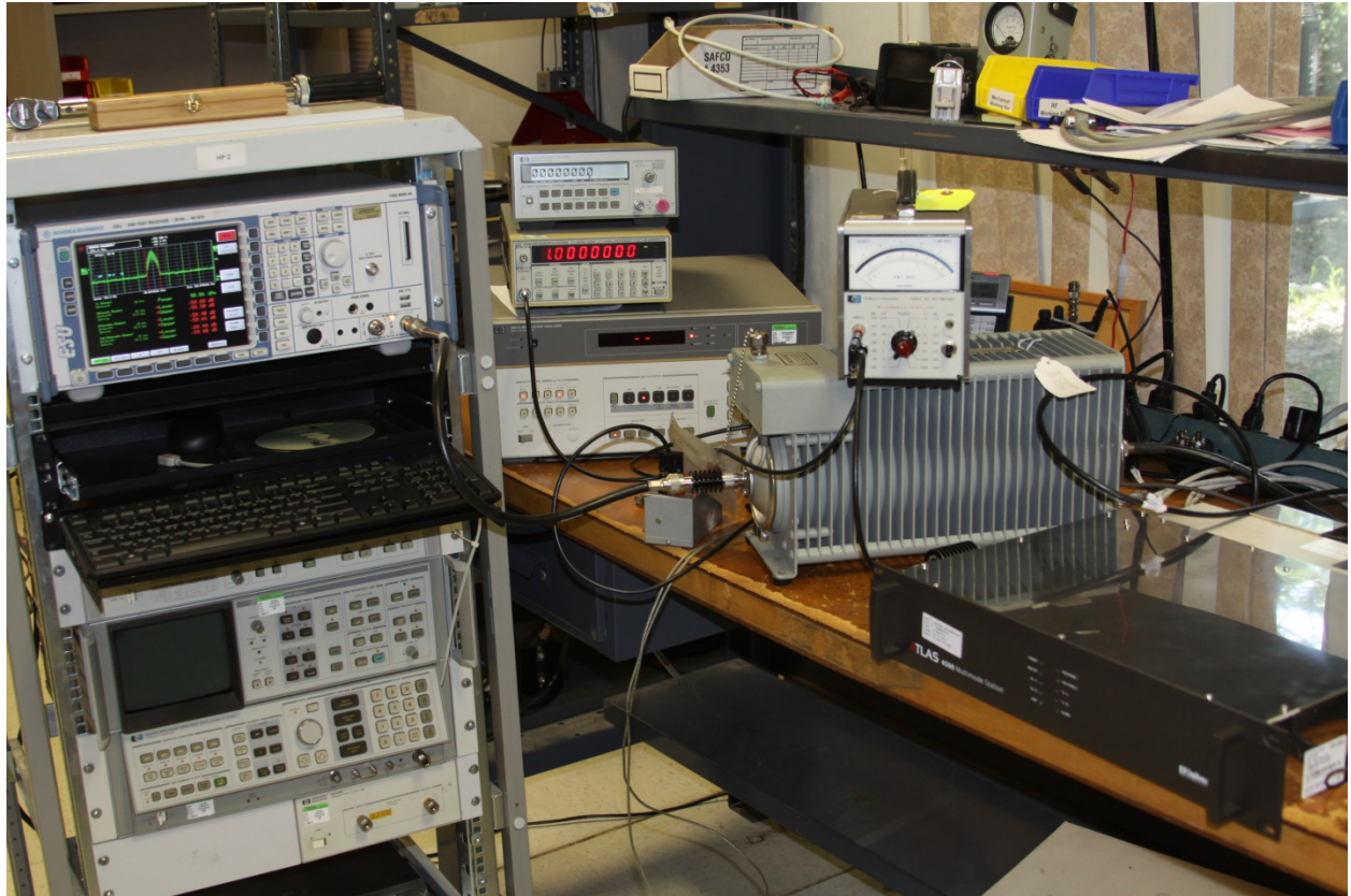
SPURIOUS EMISSIONS AT ANTENNA