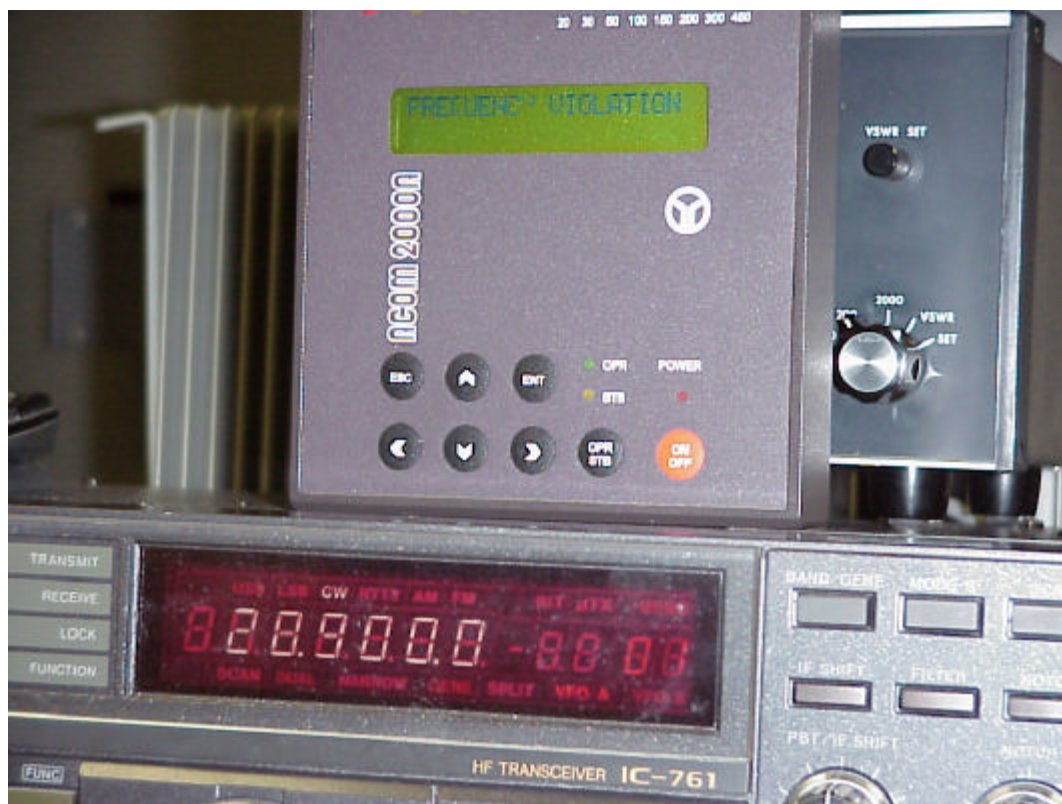
XCVR Frequency 28.90 – ACOM 2000A Frequency Violation