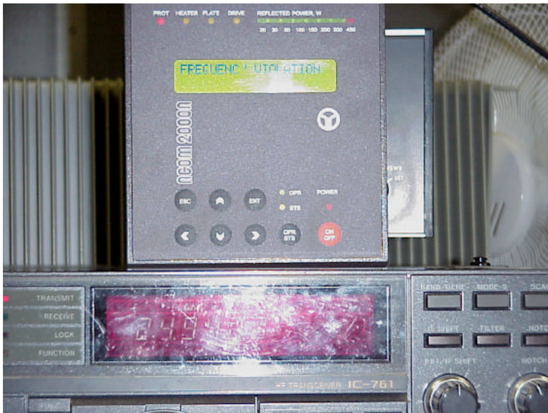
XCVR Frequency 24.94 – ACOM 2000A Frequency Violation